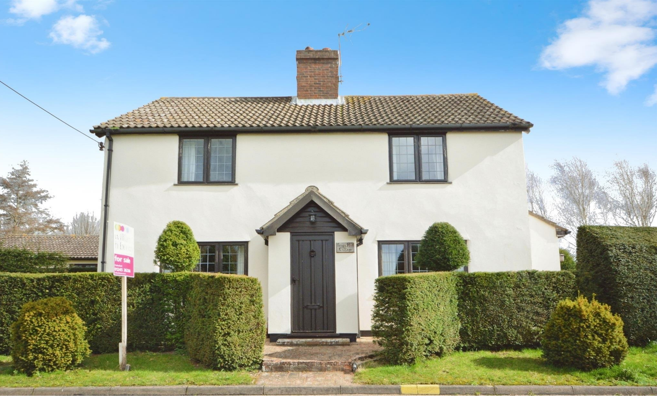
Frogs Hall Cottage, Littley Green Road, Howe Street, Chelmsford CM3 1BT