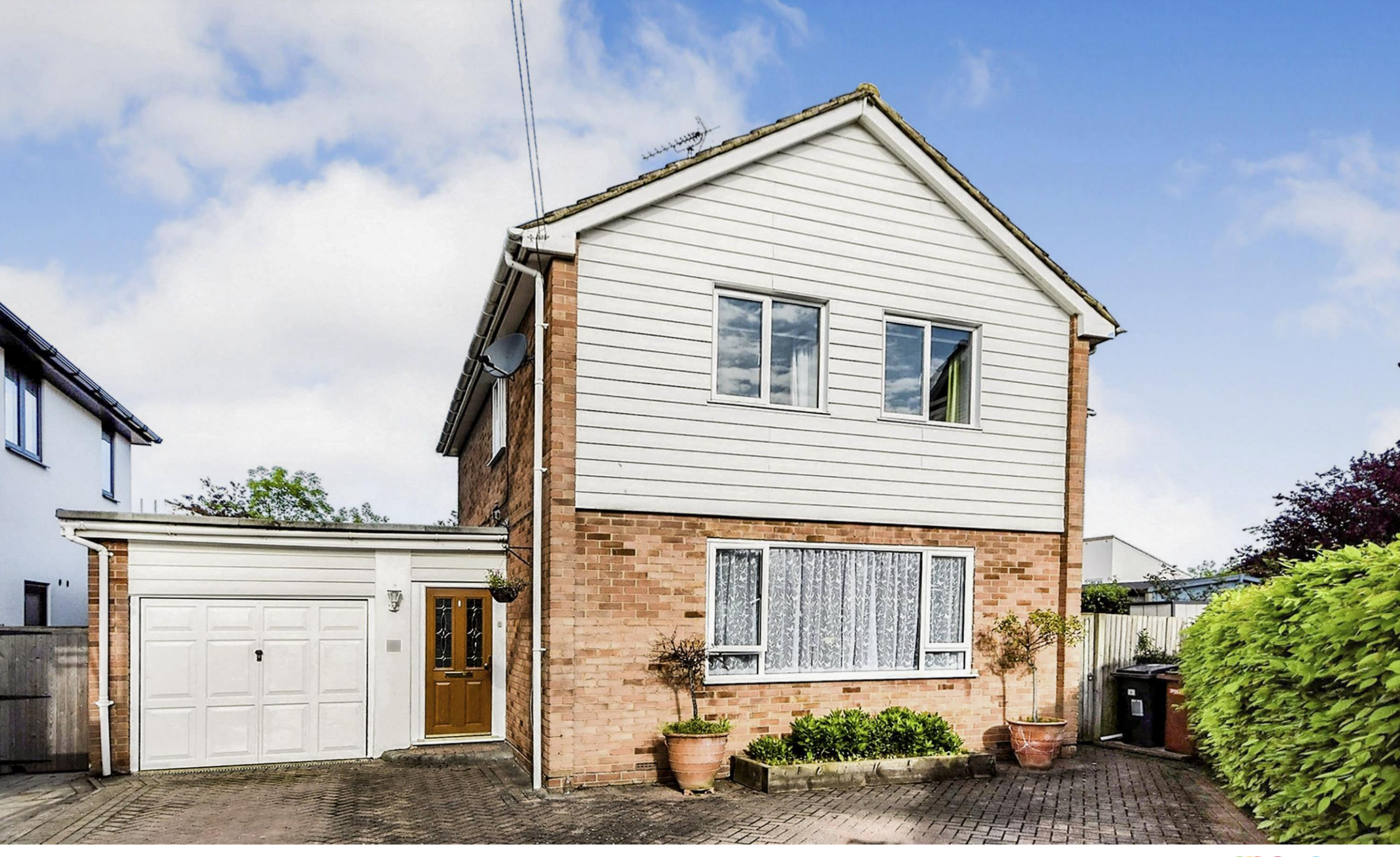
Bridon Close, East Hanningfield, Chelmsford CM3 8BA