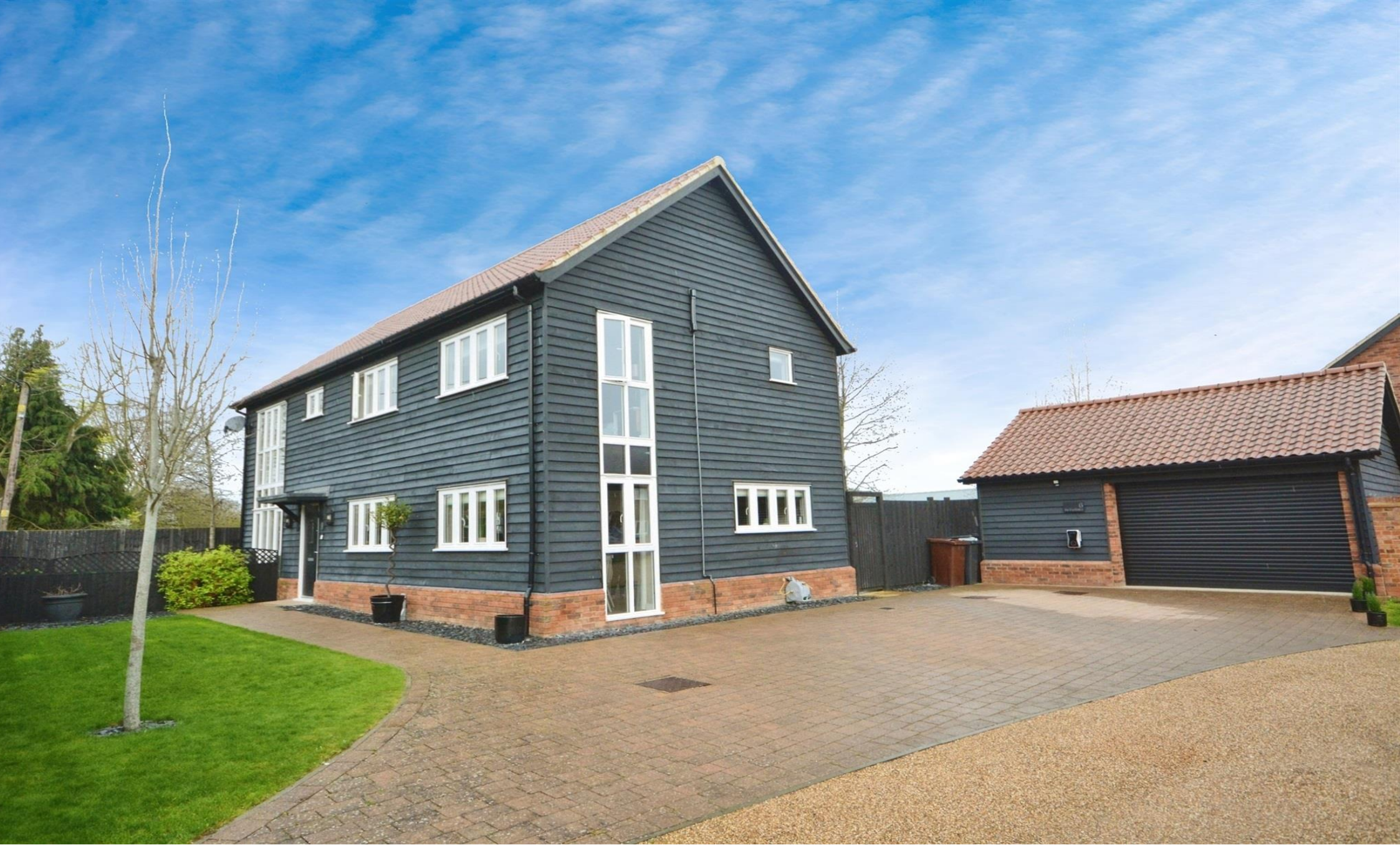
The Pastures, Writtle, Chelmsford CM1 3FH