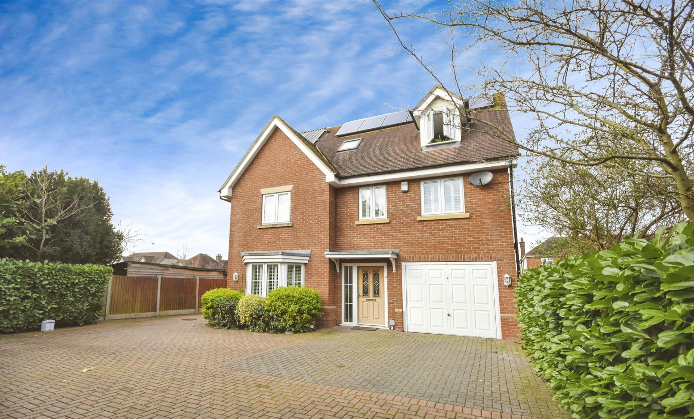
The Cedars, Chelmsford CM2 6BL