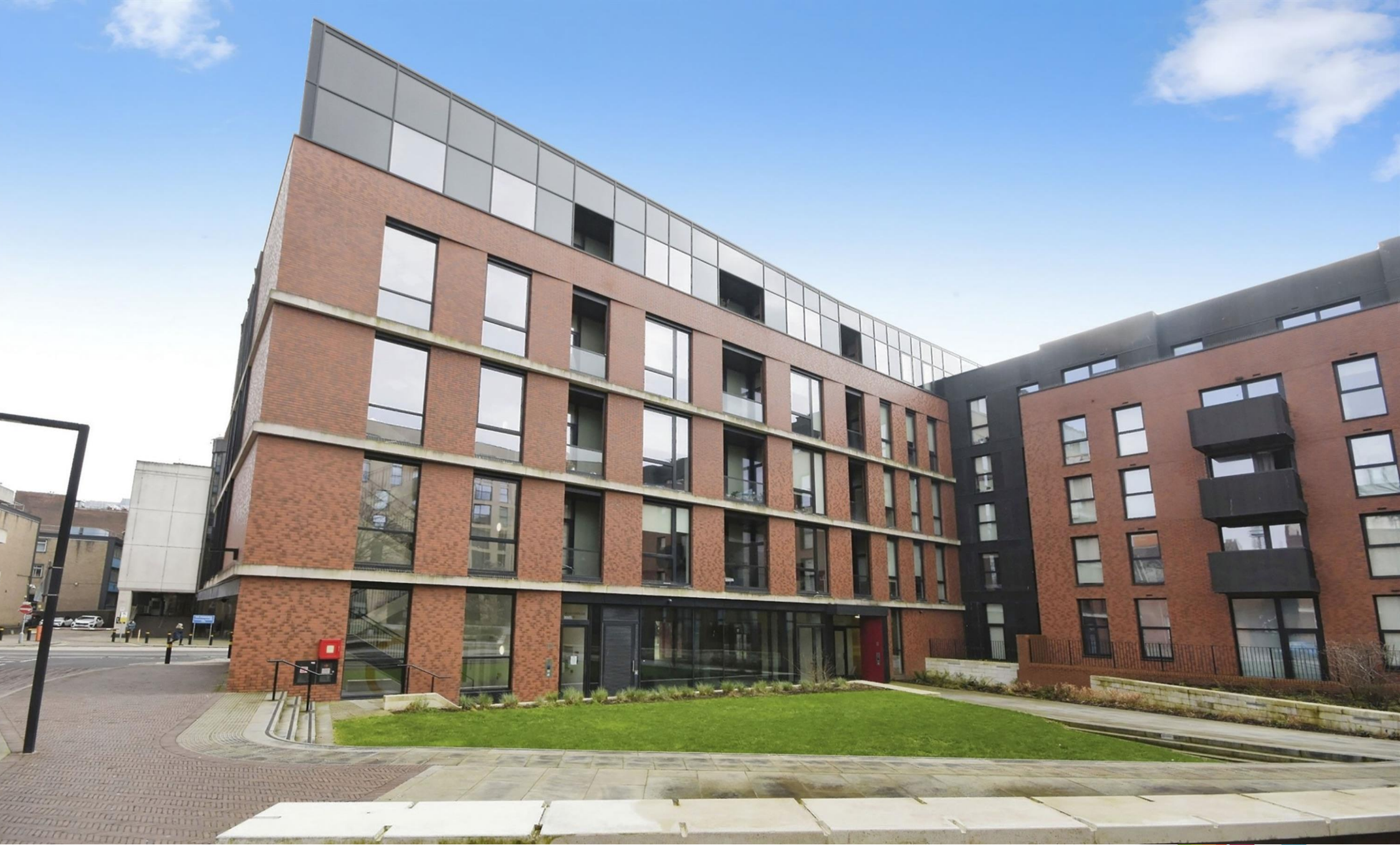
Waterhouse Court, Burgess Springs, City Centre Chelmsford CM1 1QZ