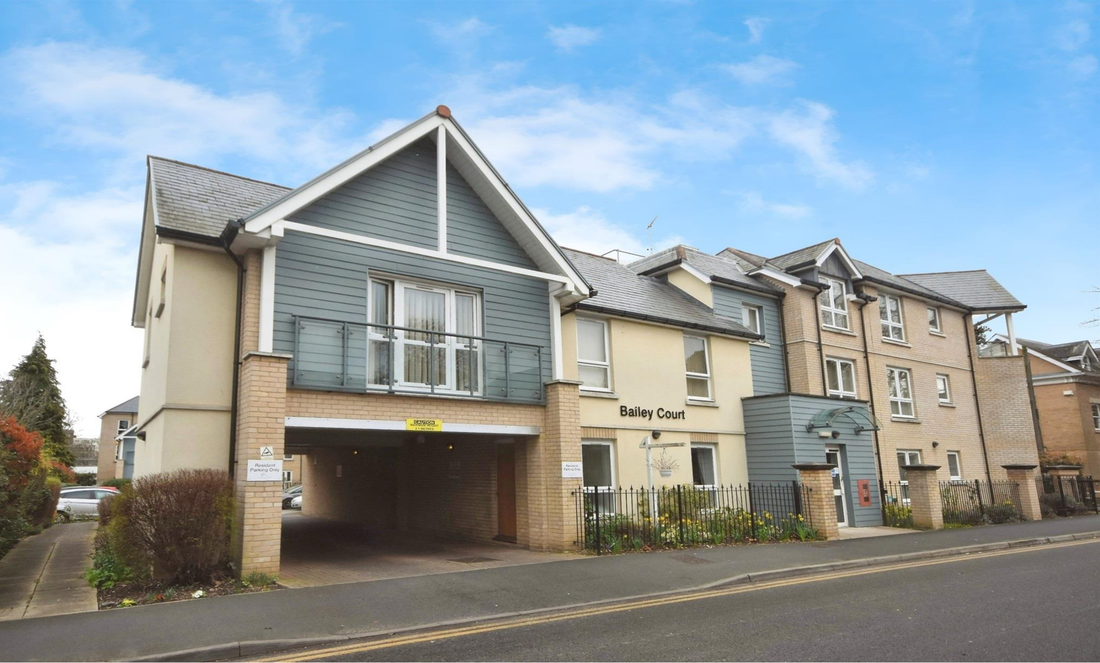
Bailey Court New Writtle Street, Chelmsford CM2 0FS