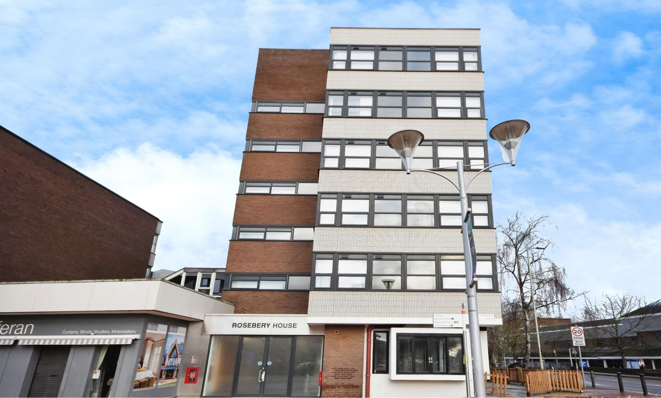
Rosebery House, Springfield Road, CHELMSFORD CM2 6ZP