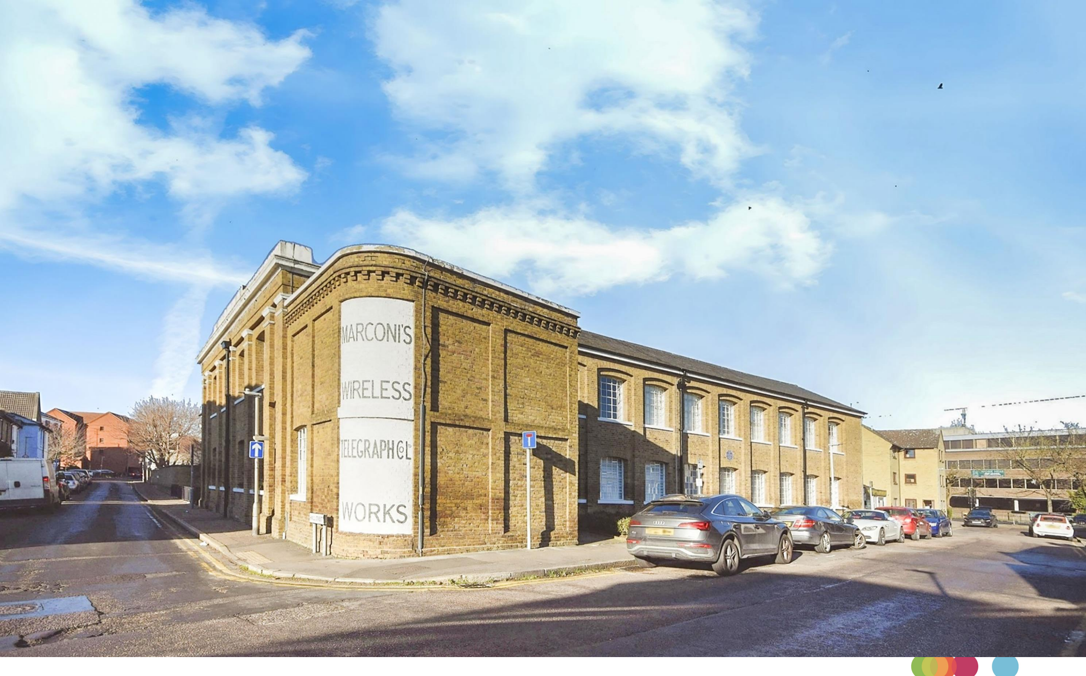
Mildmay Road, Old Moulsham, Chelmsford CM2 0DX