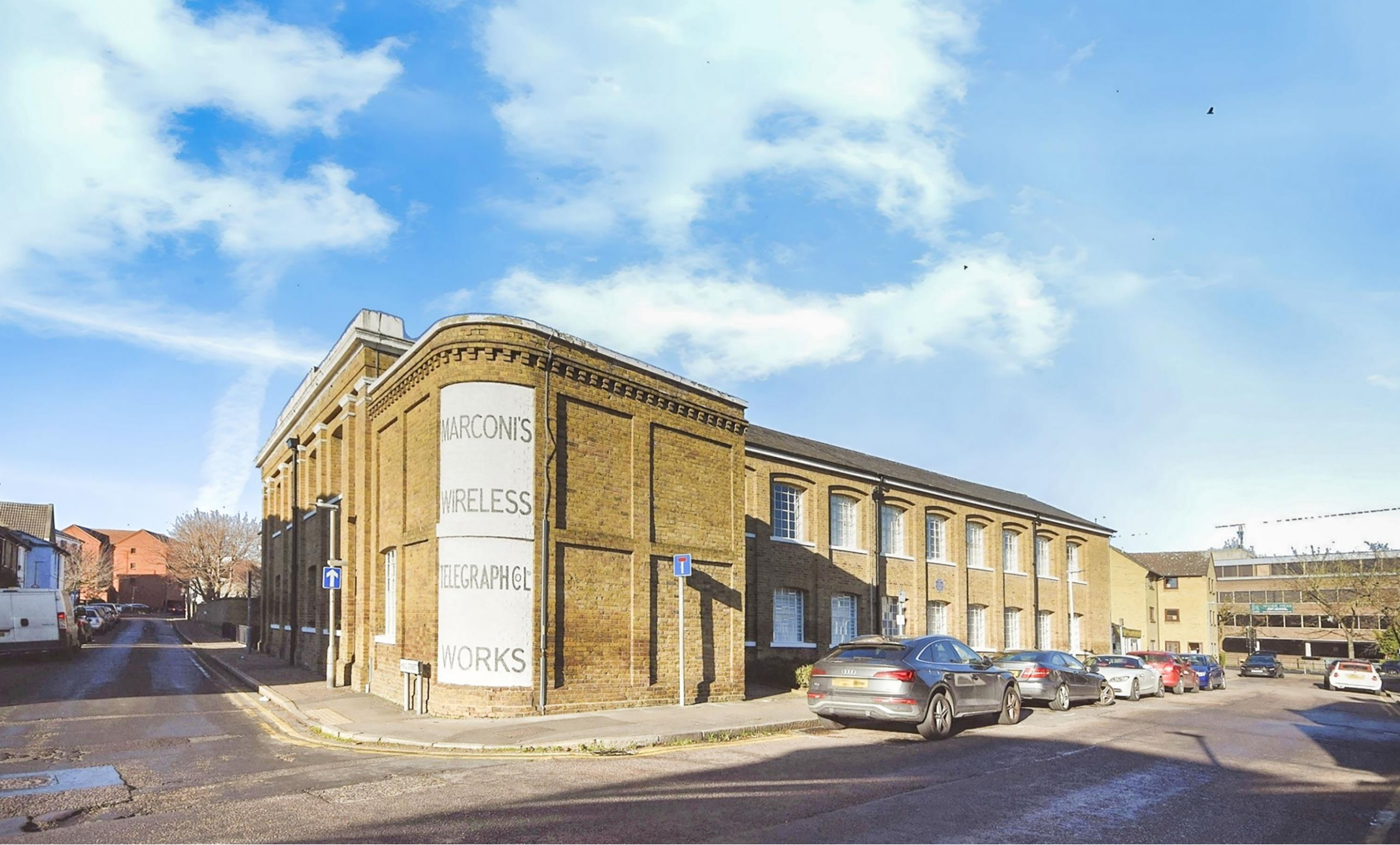
Mildmay Road, Chelmsford CM2 0DX