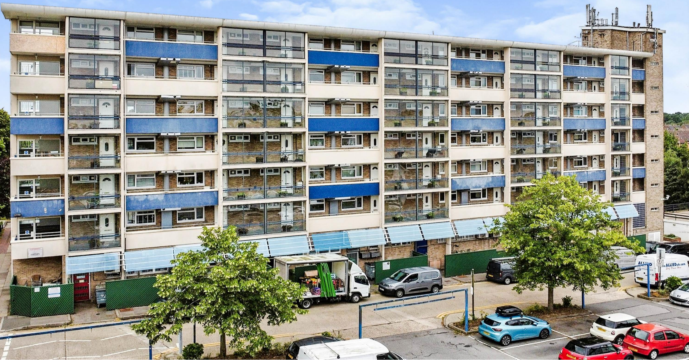
The Vineyards, Great Baddow, Chelmsford CM2 7QS