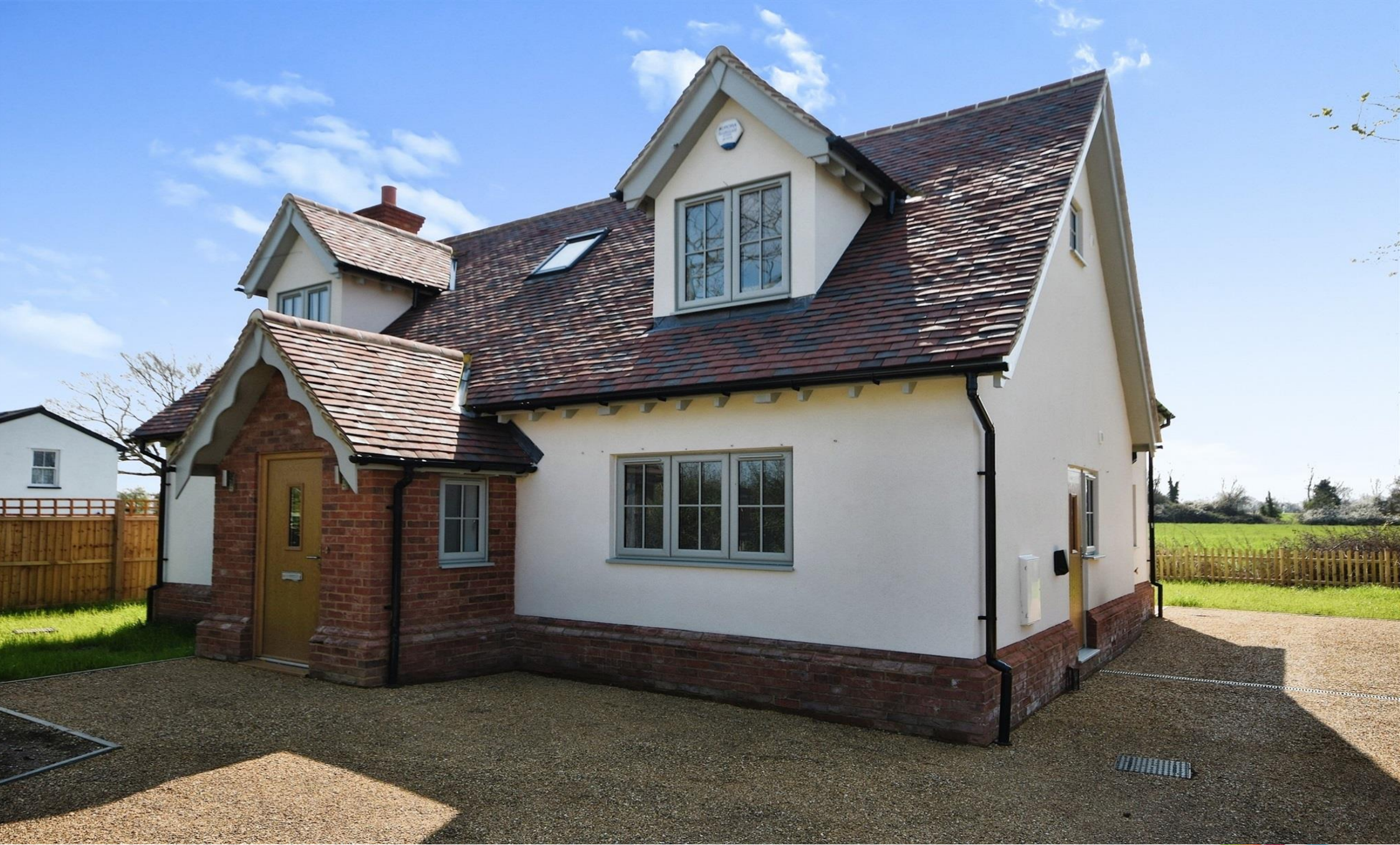
Pittodrie Larks Lane, Broads Green, Chelmsford CM3 1AD