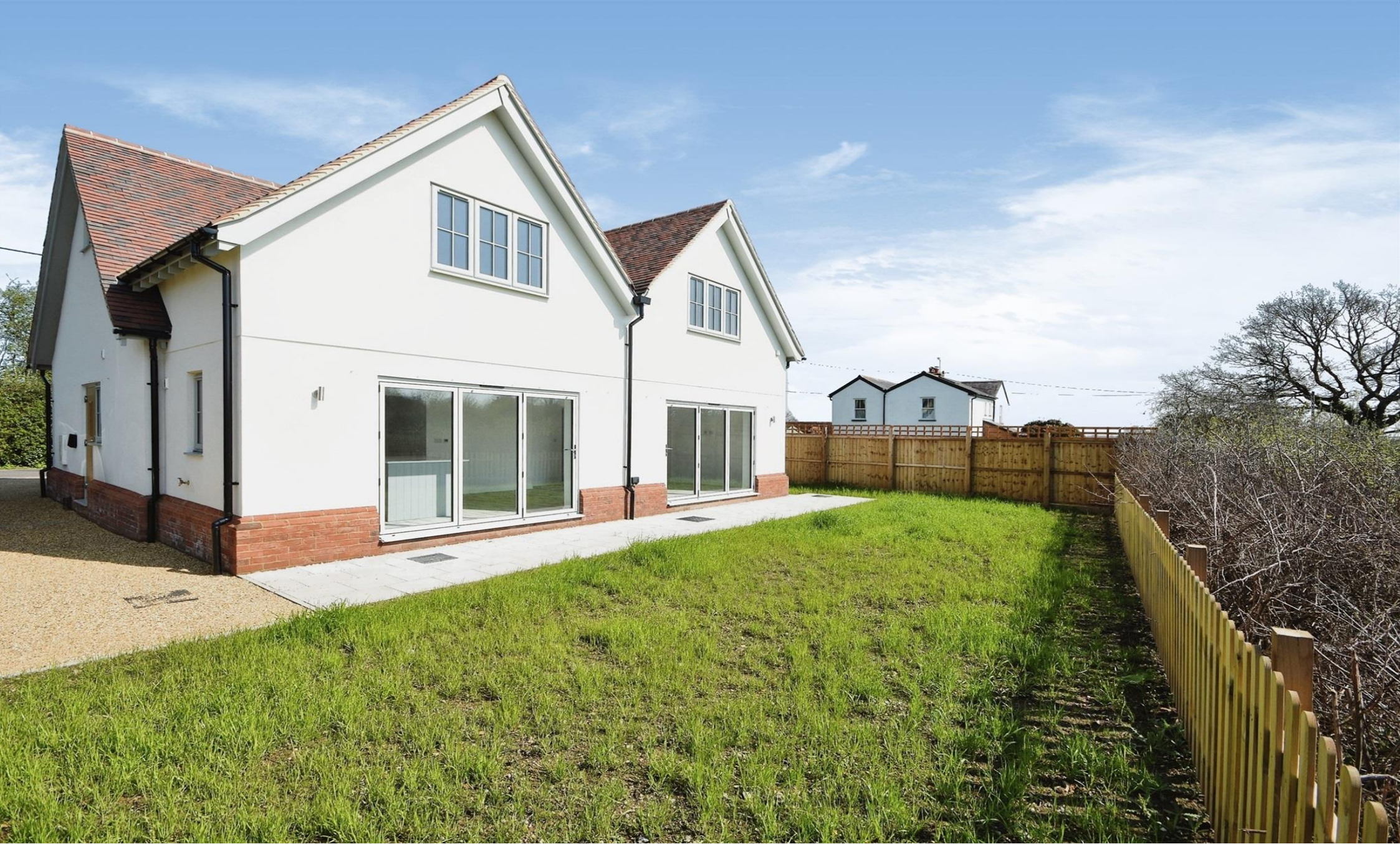
Pittodrie Larks Lane, Broads Green Chelmsford CM3 1AD