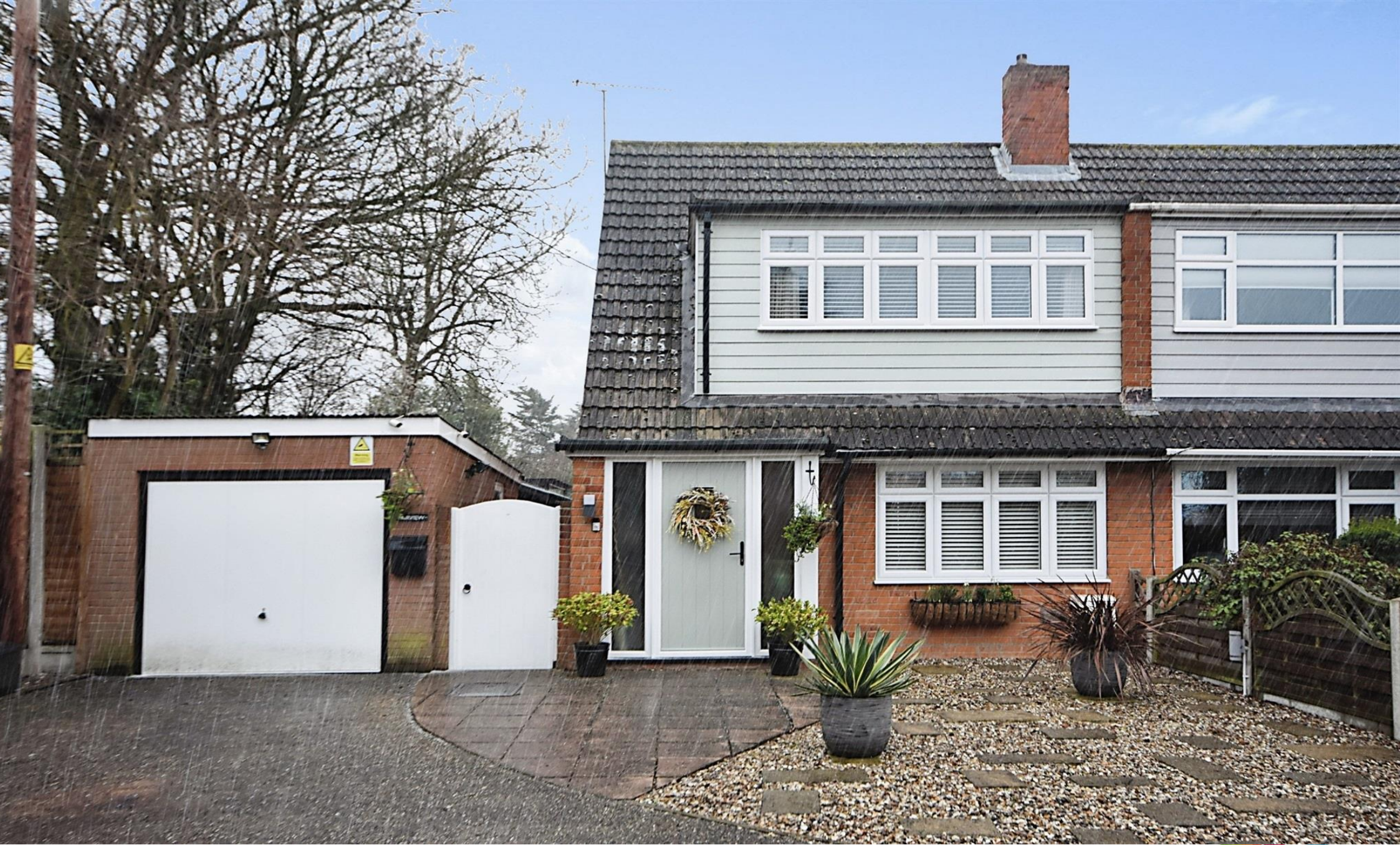
Fairview Old Wickford Road, South Woodham Ferrers, Chelmsford CM3 5QS