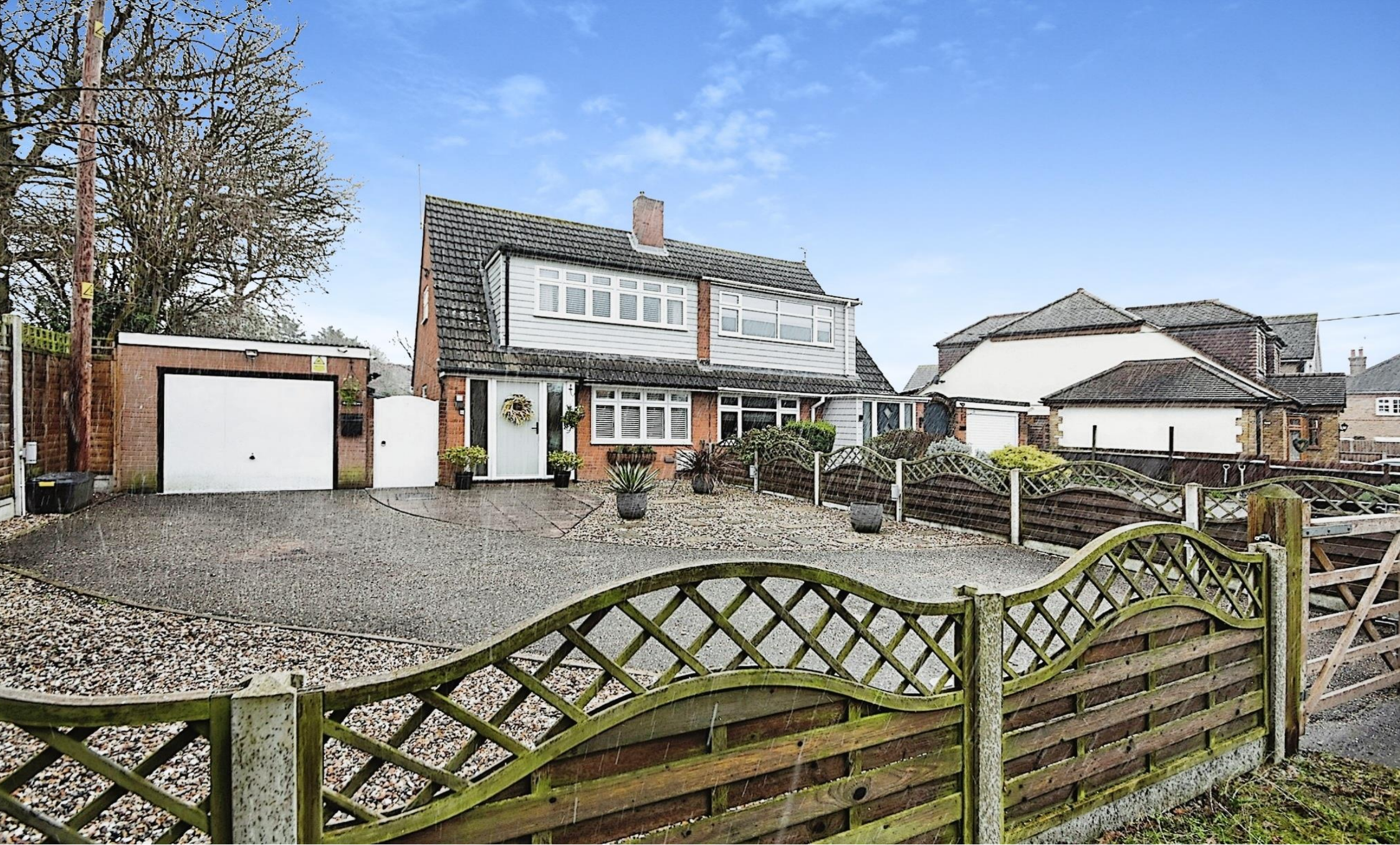
Fairview Old Wickford Road, South Woodham Ferrers Chelmsford CM3 5QS