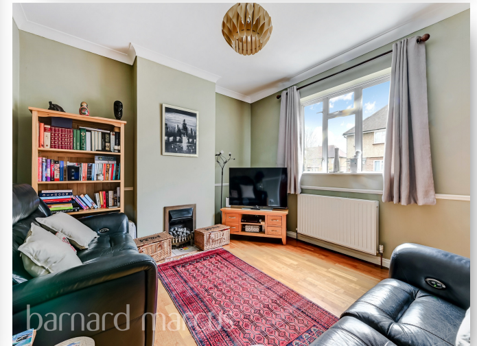
Gladstone Road, Surbiton, KT6 5DD