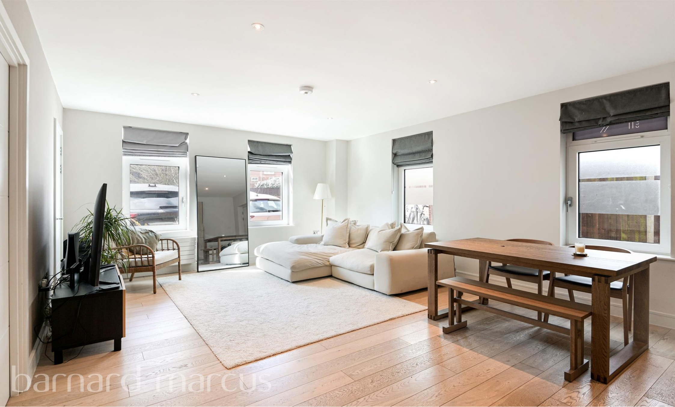
Hare Lane, Claygate Esher KT10 0RB

Not for marketing purposes. INTERNAL USE ONLY