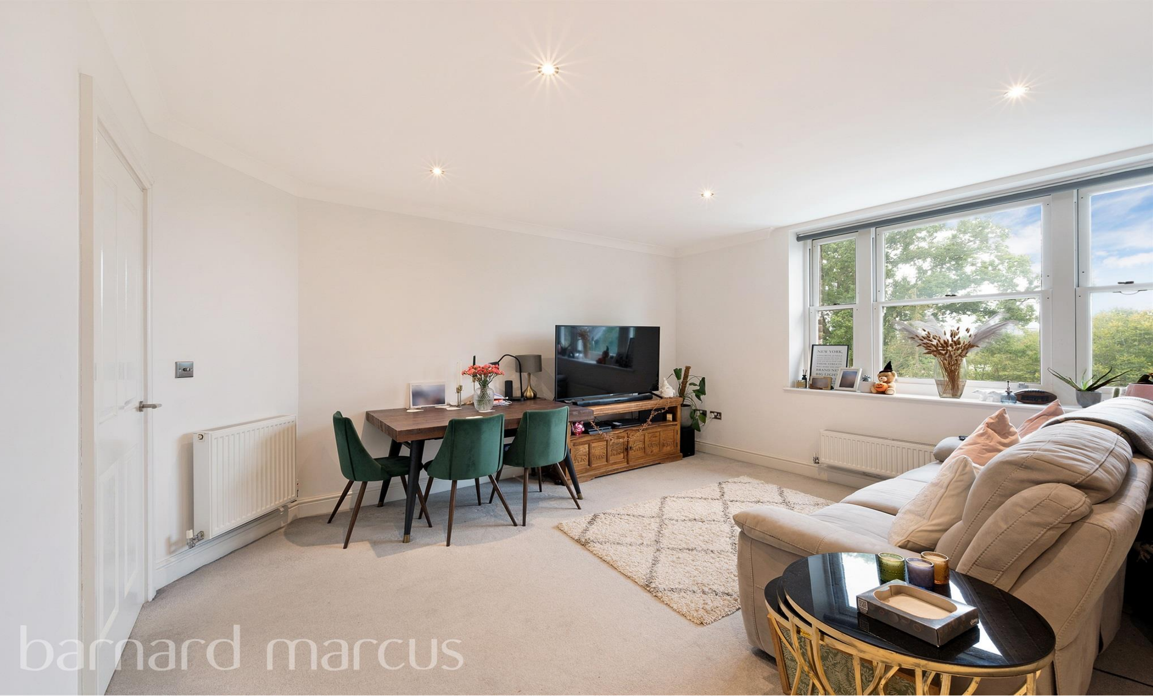
Longwood House Langley Road, Surbiton KT6 6BA