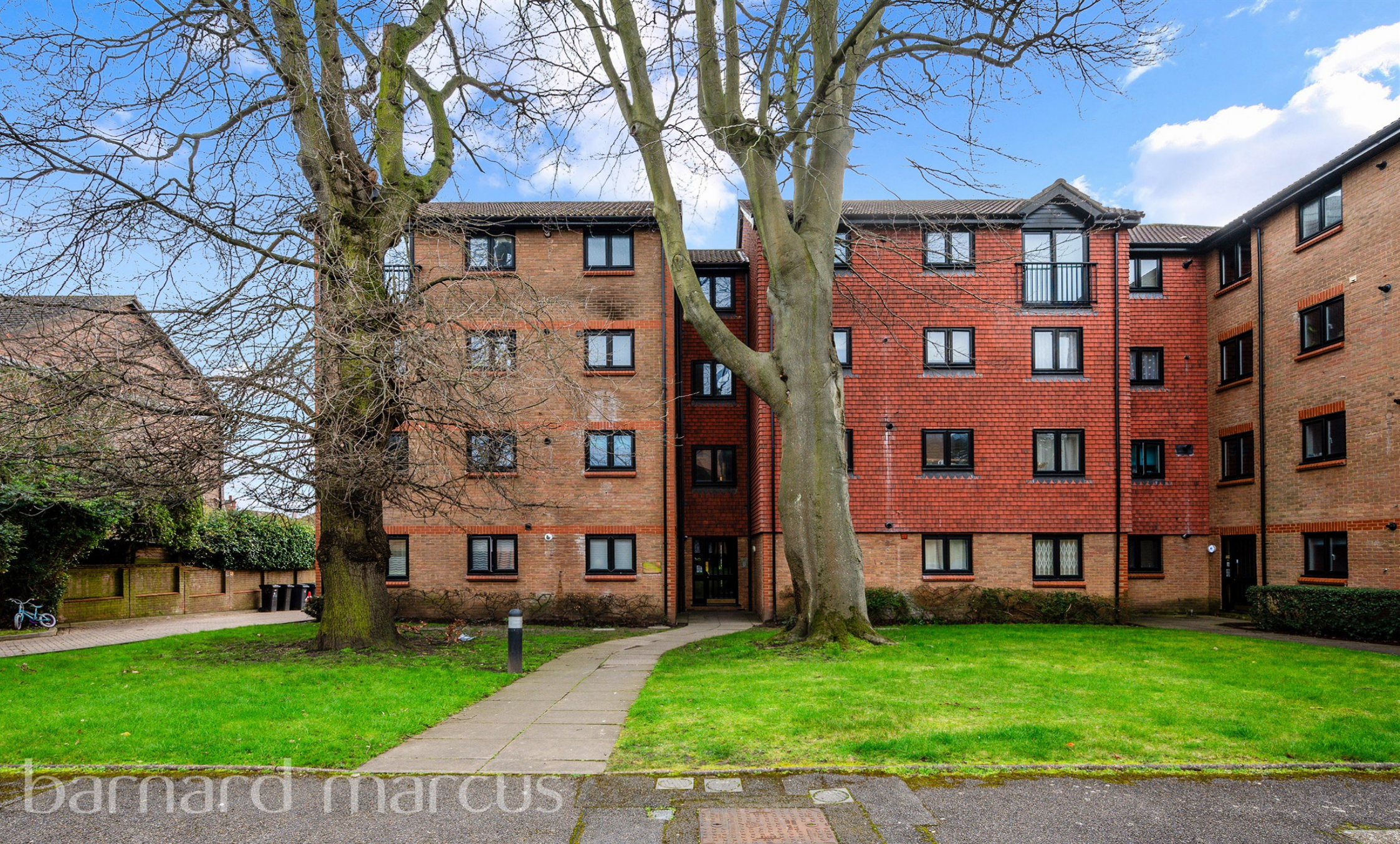
Palace Court, Adams Close, Surbiton, KT5 8LB