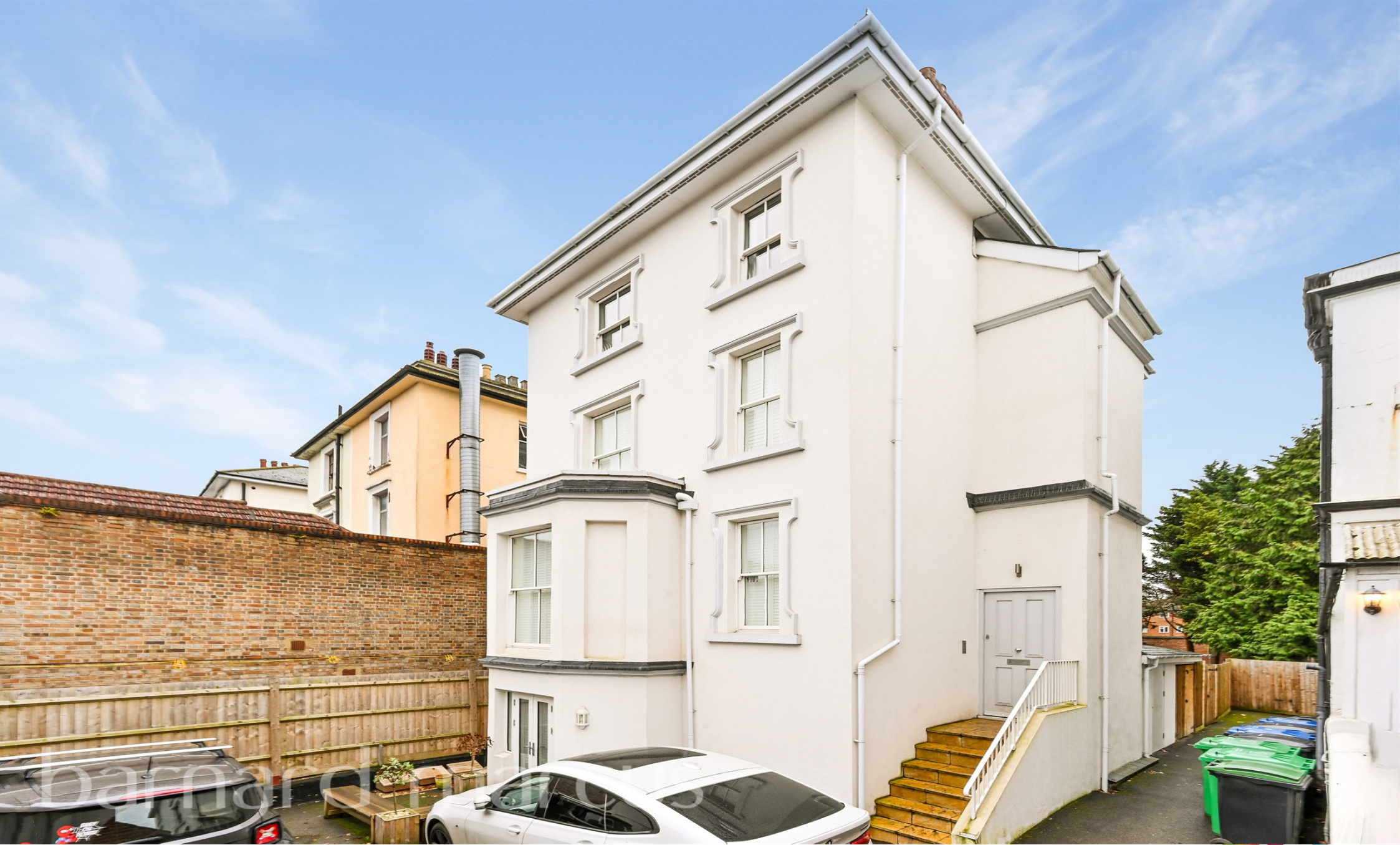
Ewell Road, Surbiton KT6 6HE