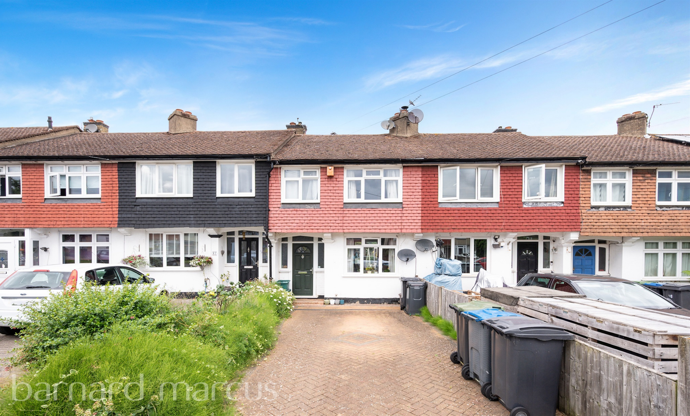
Knollmead, Surbiton, KT5 9QR