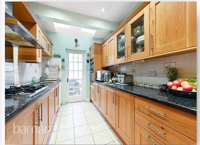
Beresford Avenue, Surbiton, KT5 9LS