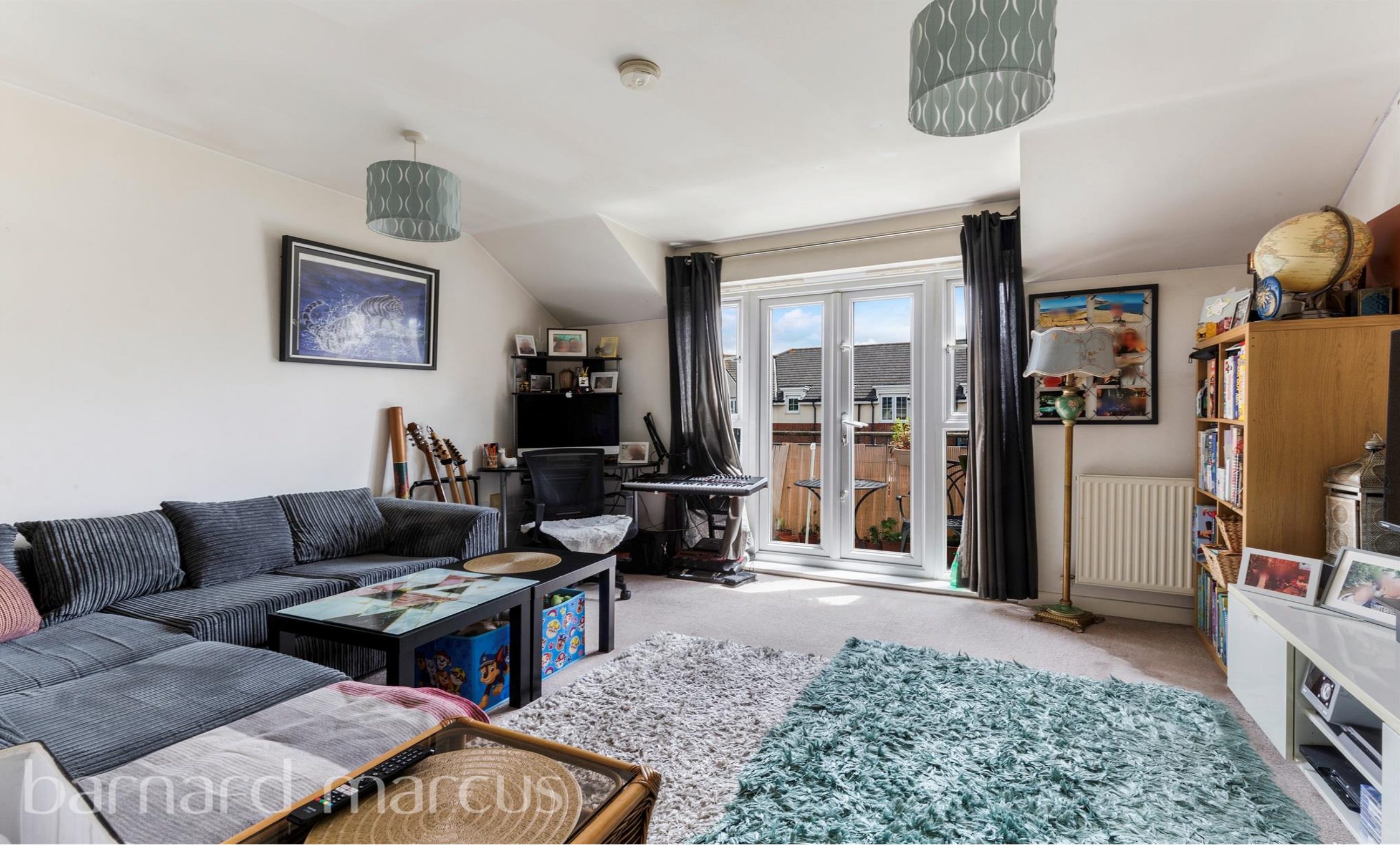
Damson House Hemlock Close, London SW16 5PL