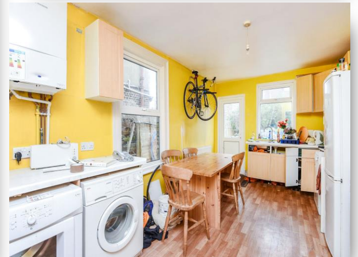
Colmer Road, London, SW16 5LA