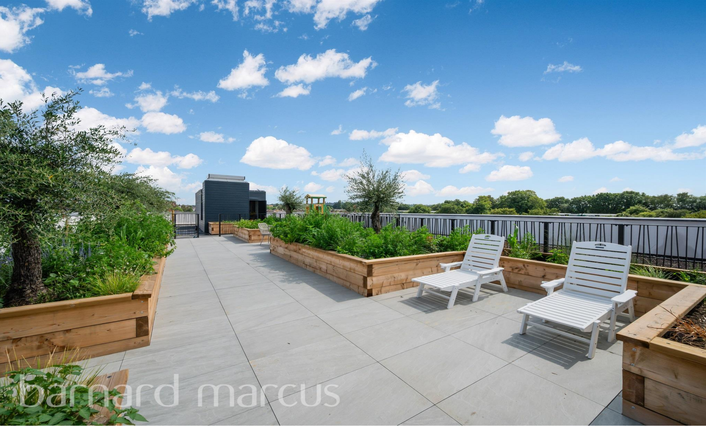
Meadow House Fallsbrook Road, London SW16 6DY