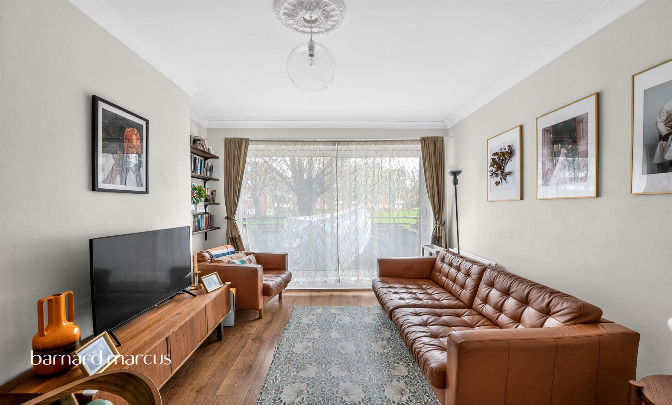
Busby House Aldrington Road, London SW16 1TZ