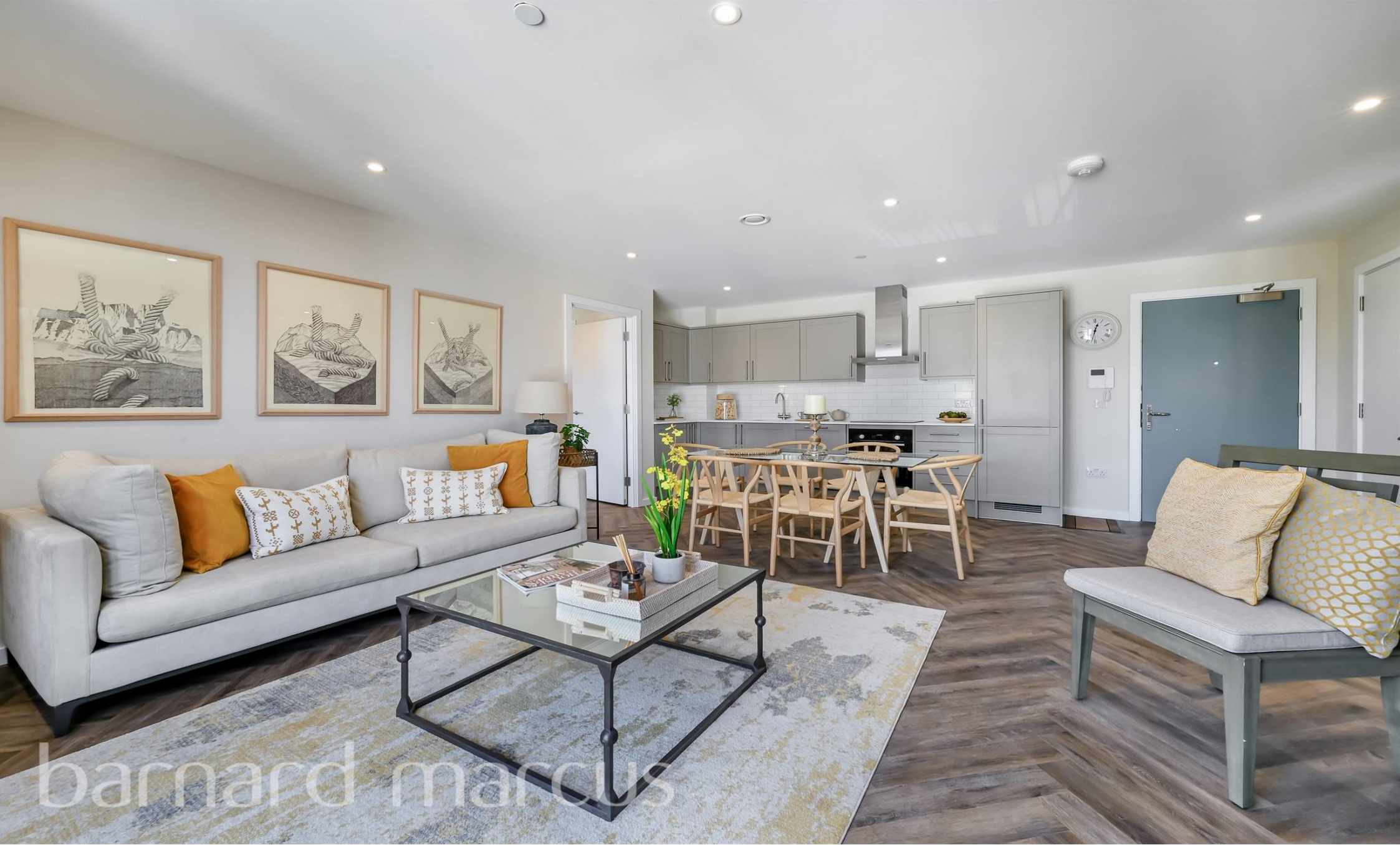
Meadow House Fallsbrook Road, London SW16 6DY