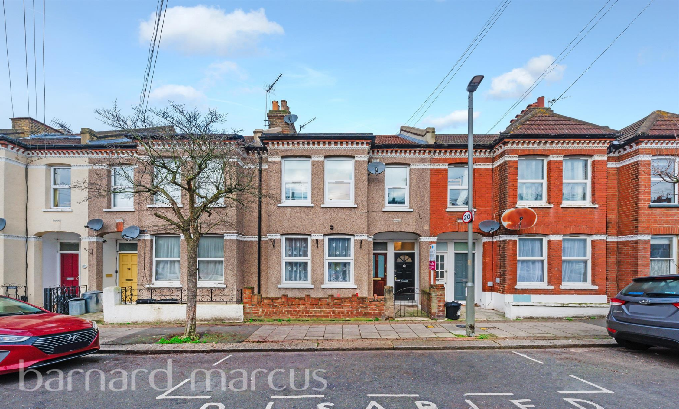
Leveson Street, LONDON SW16 6DF