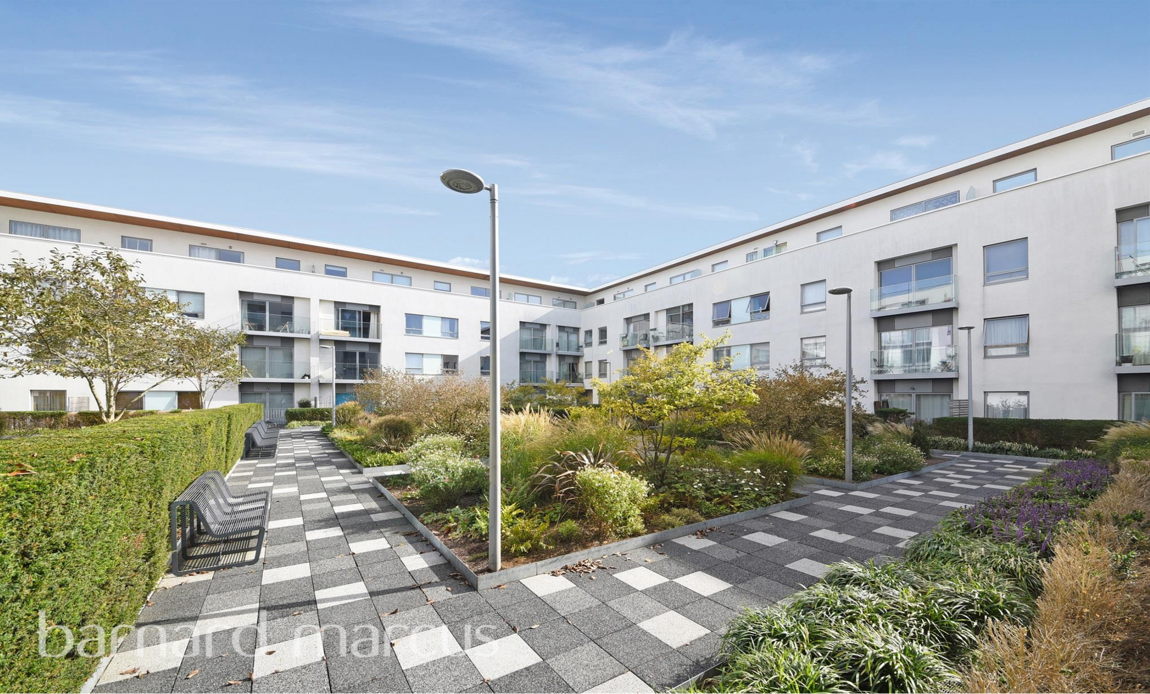
Derry Court Streatham High Road, London SW16 6AT