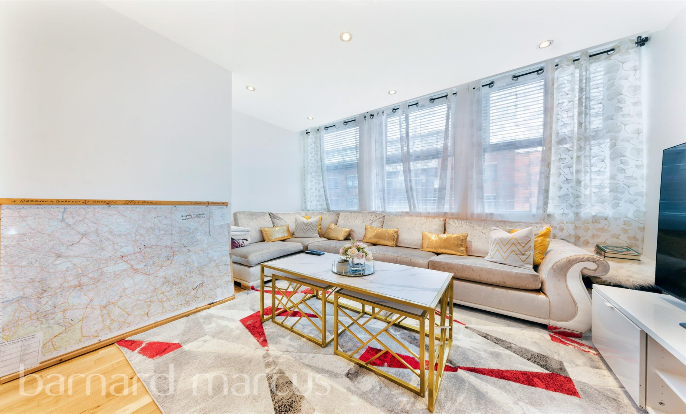
Norwich House Streatham High Road, London SW16 1DG