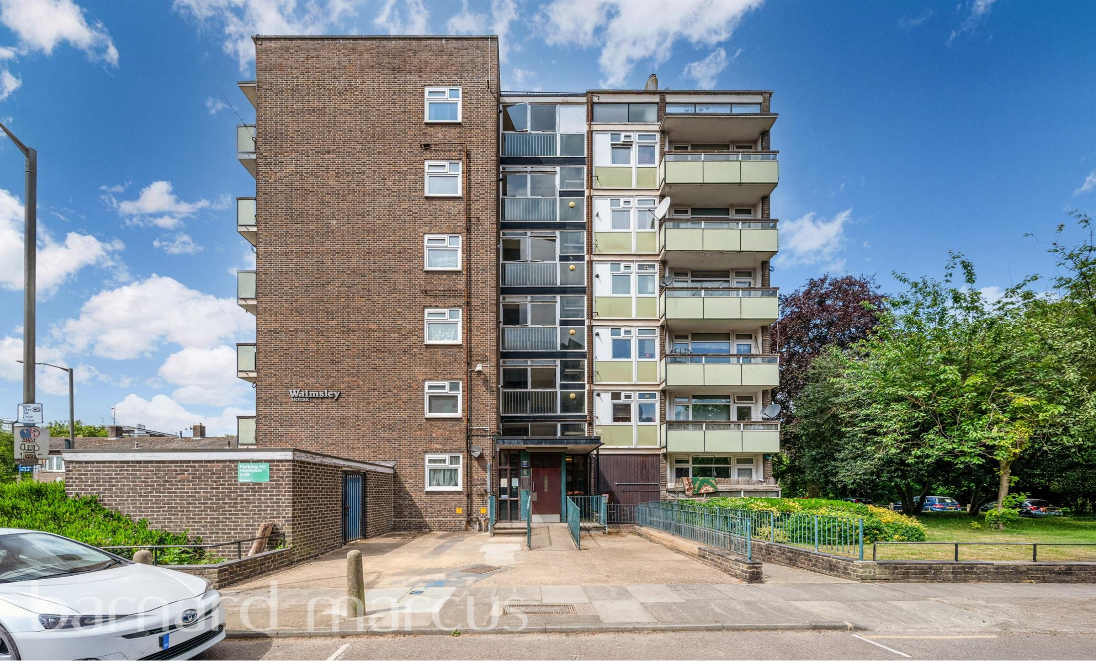
Walmsley House Colson Way, London SW16 1RH