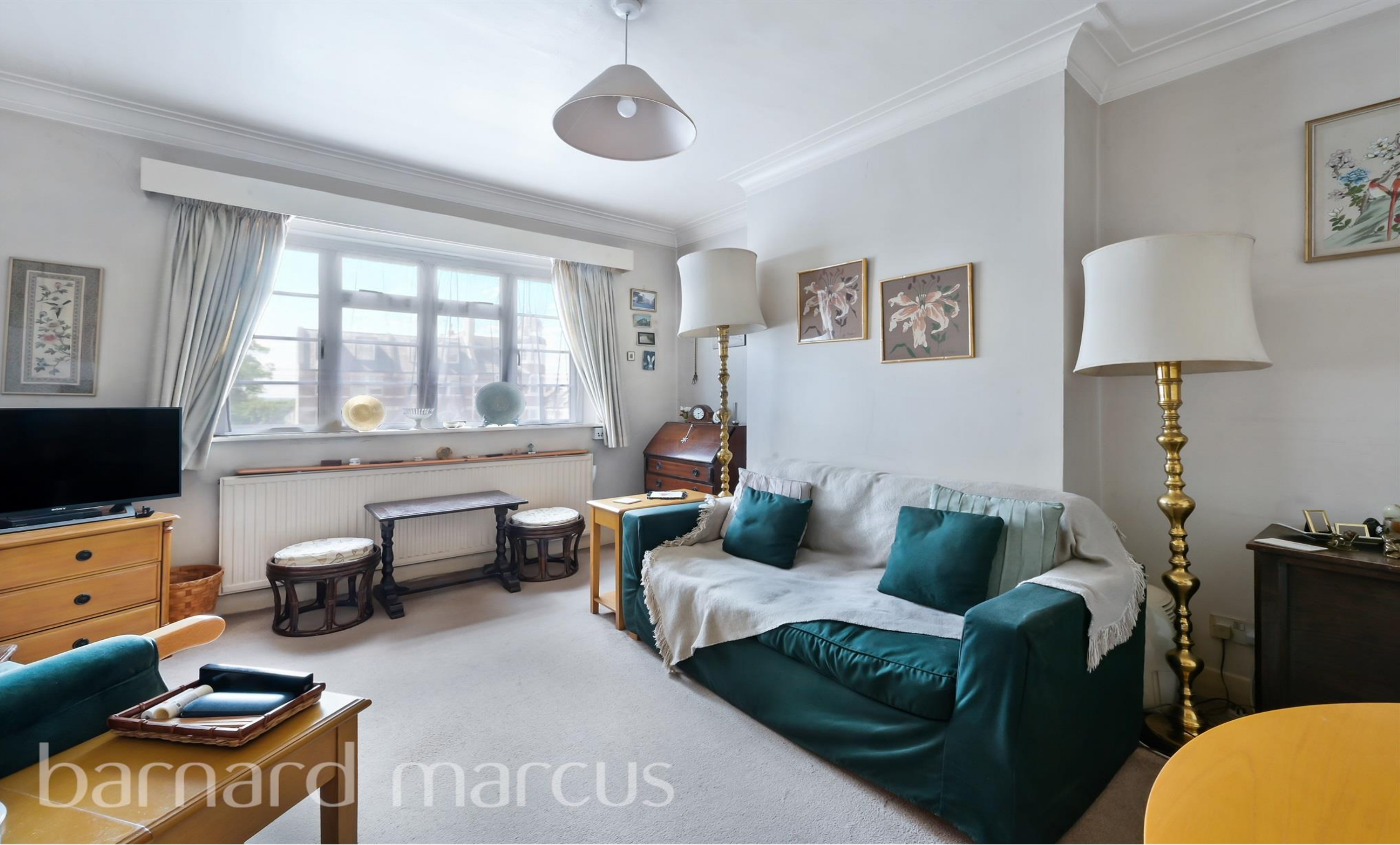
The High Streatham High Road, London SW16 1HA