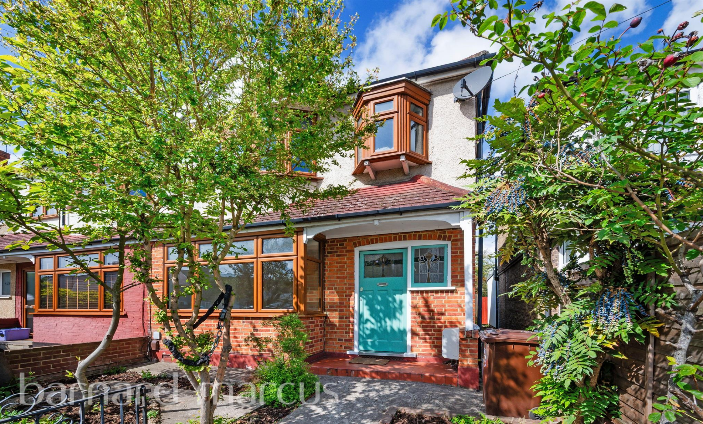
Rowan Road, London SW16 5JF