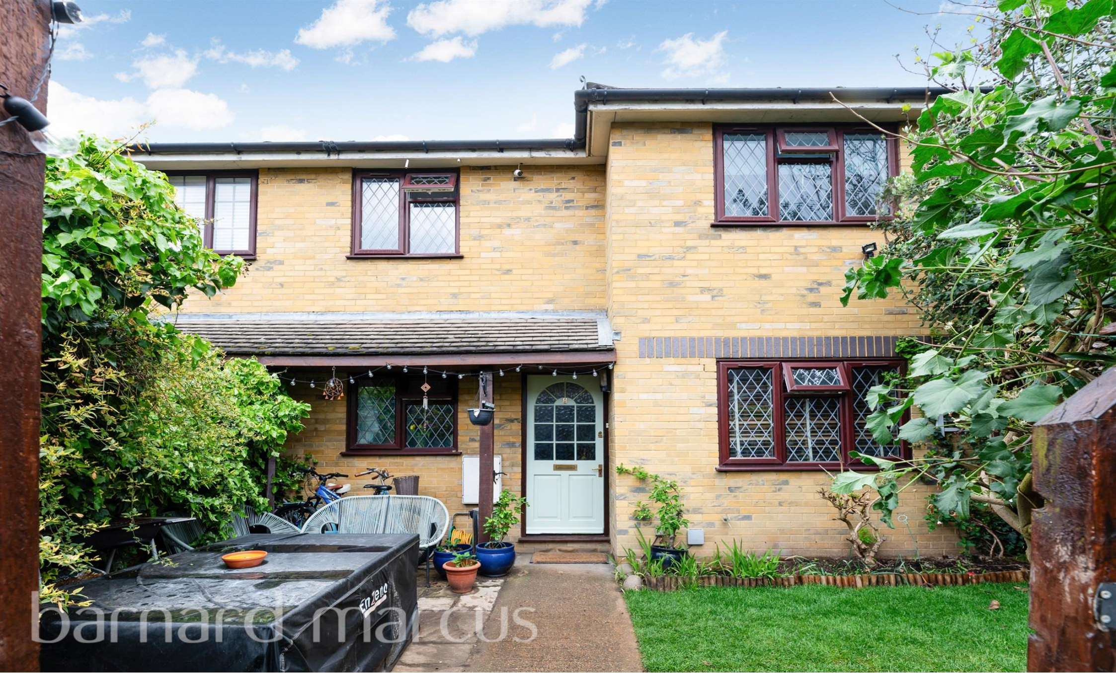
Rackham Mews, London SW16 6BE