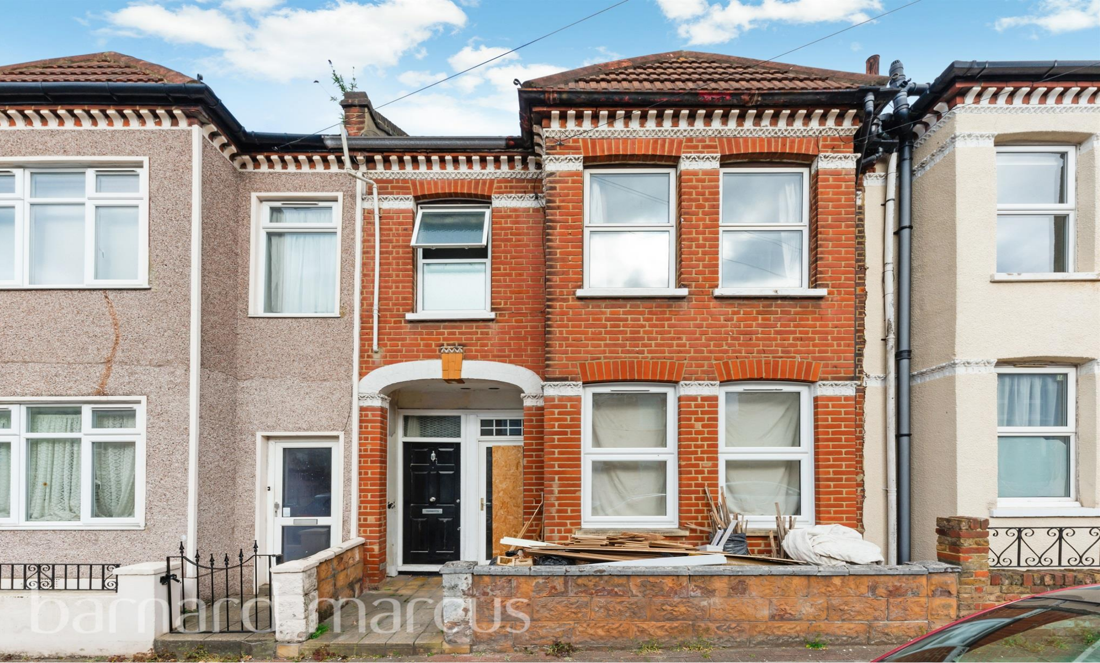
Leveson Street, London SW16 6DF