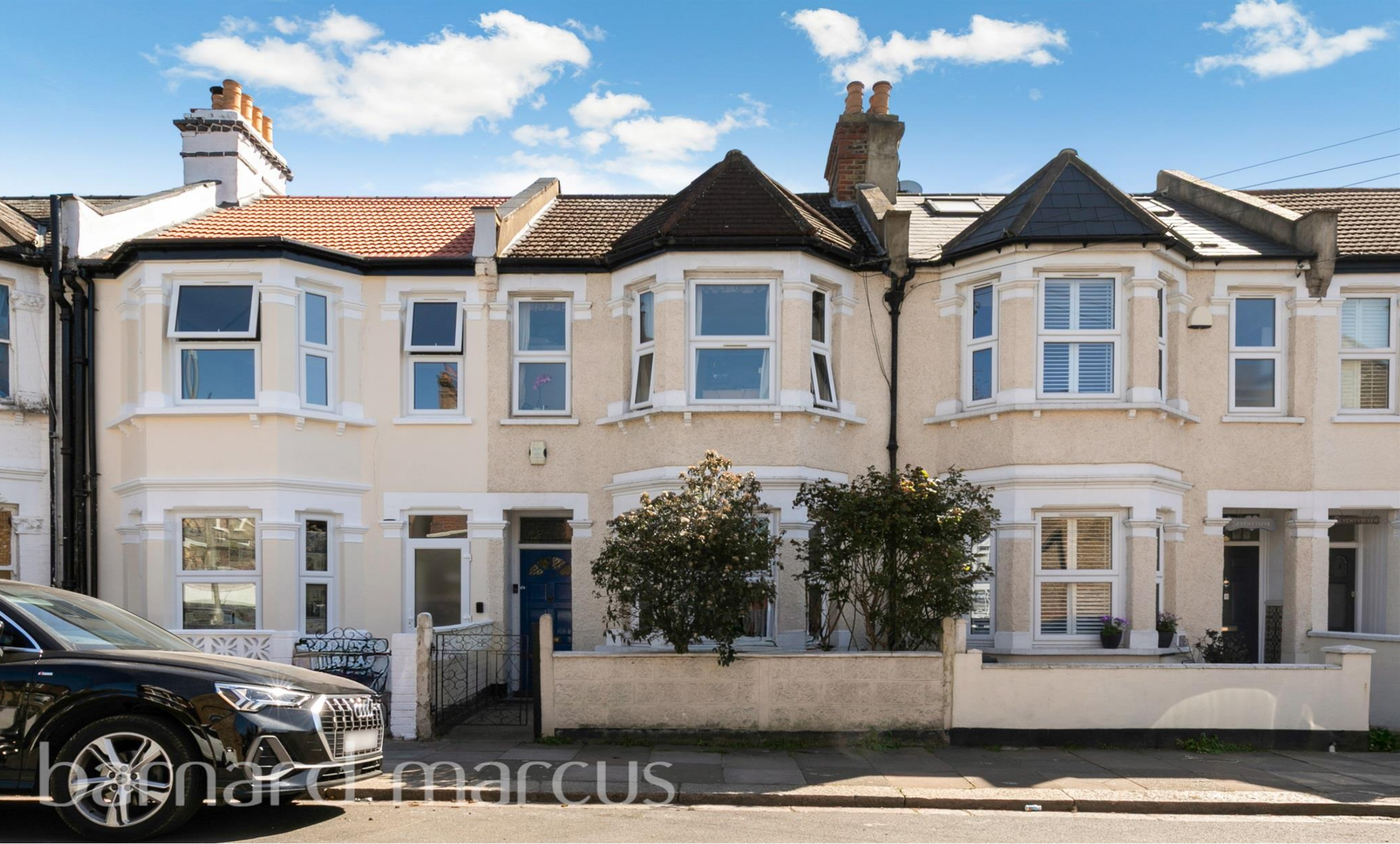
Fallsbrook Road, London SW16 6DU