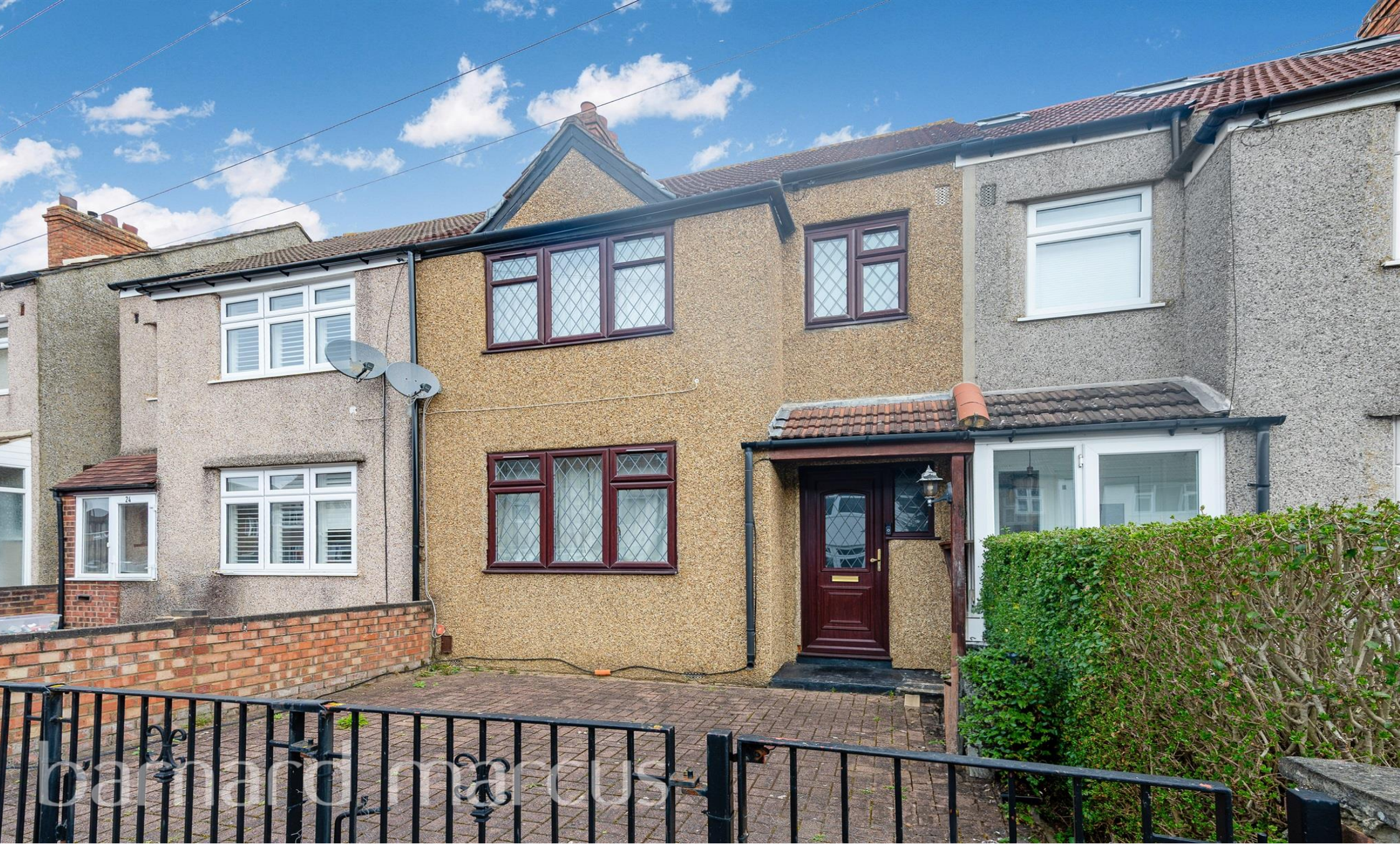
Middle Road, London SW16 4HW