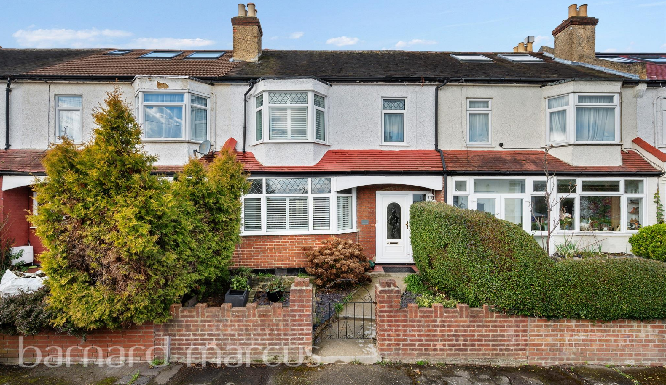
Hubbard Road, London SE27 9PJ