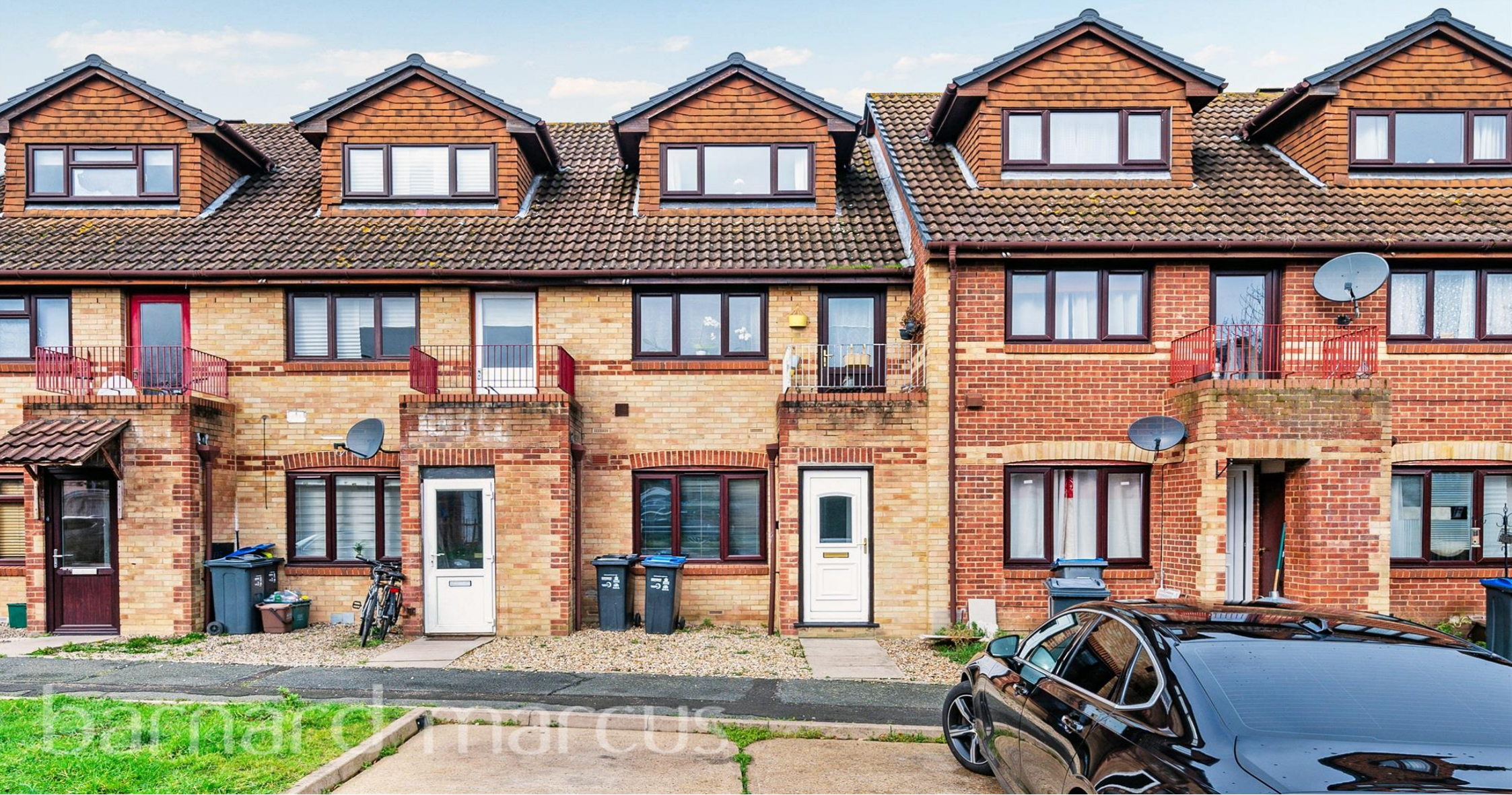
Veronica Gardens, London SW16 5JR