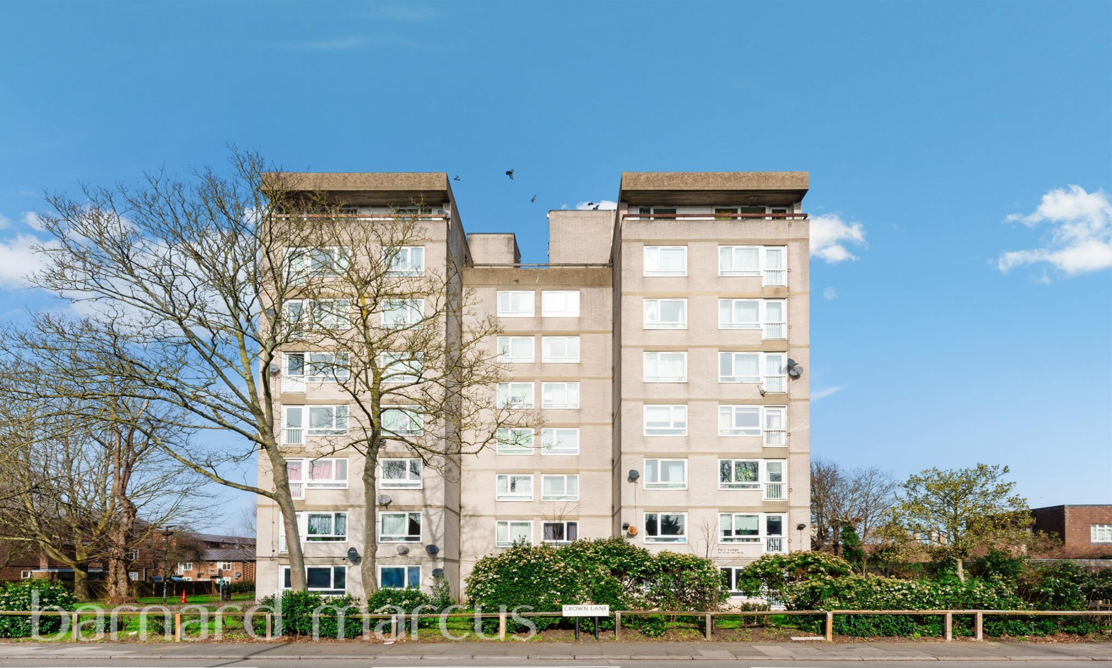
Fern Lodge Crown Lane, London SW16 3HY