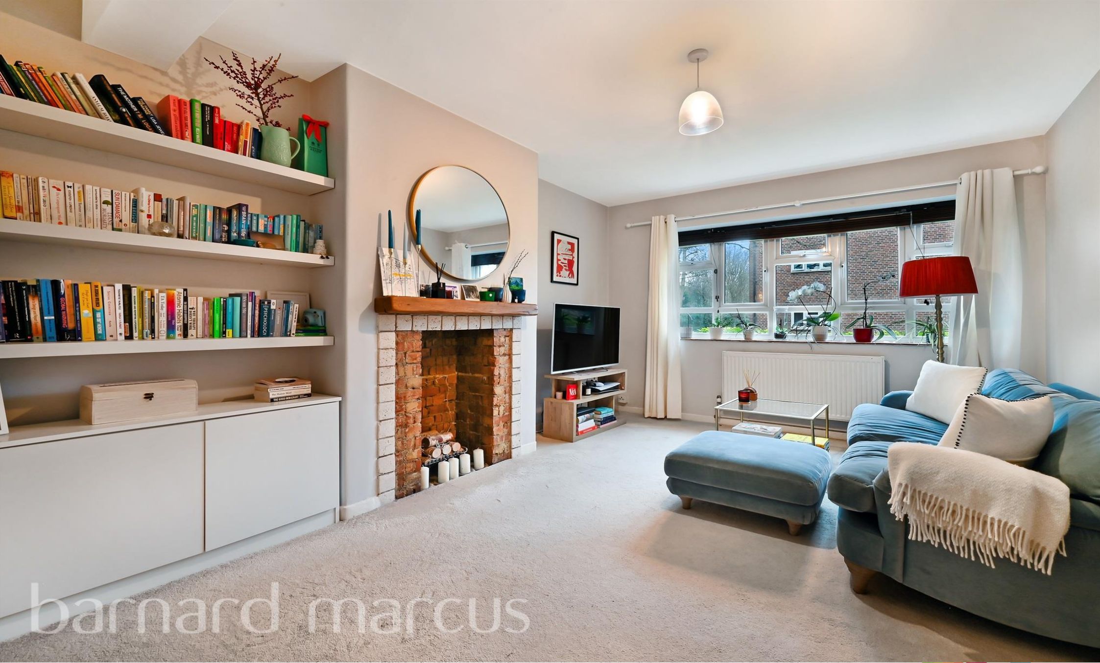
Shenstone House Aldrington Road, London SW16 1TL