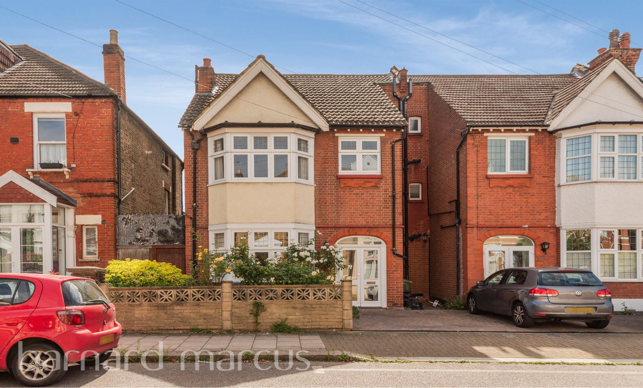
Barrow Road, London SW16 5PG