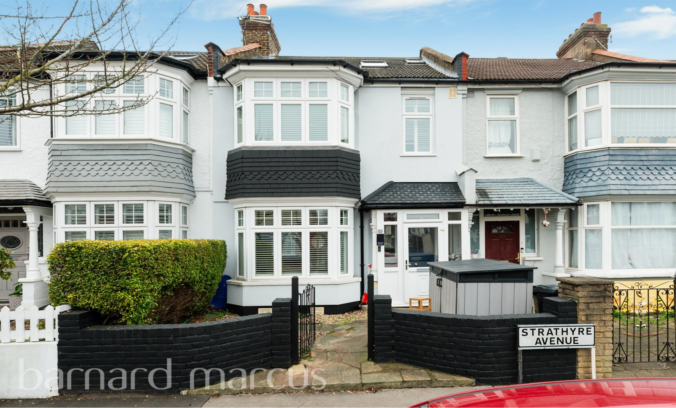
Strathyre Avenue, London SW16 4RH