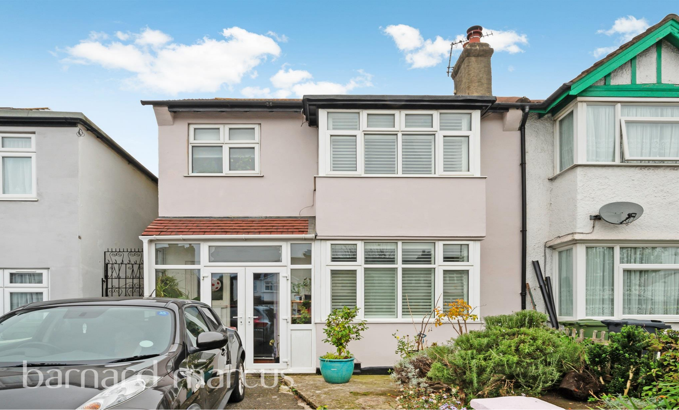
Streatham Vale, London SW16 5TD