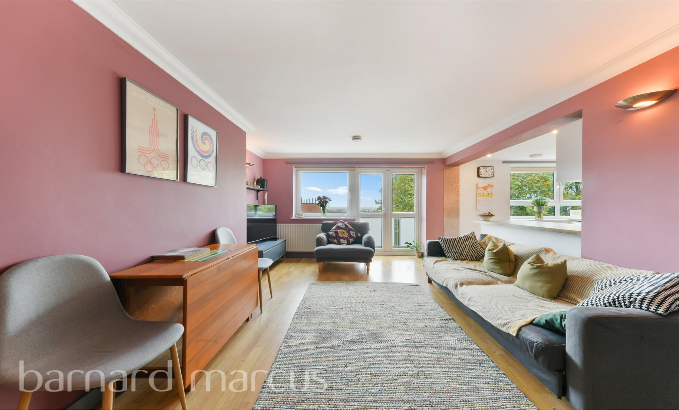
Carew House Leigham Court Road, London SW16 2RL