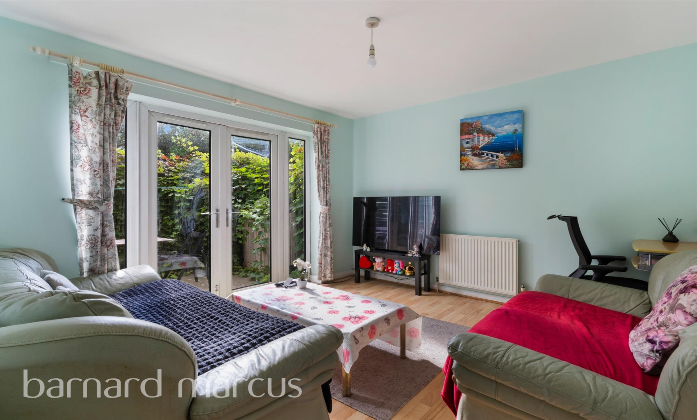
Keens Close, London SW16 6LD