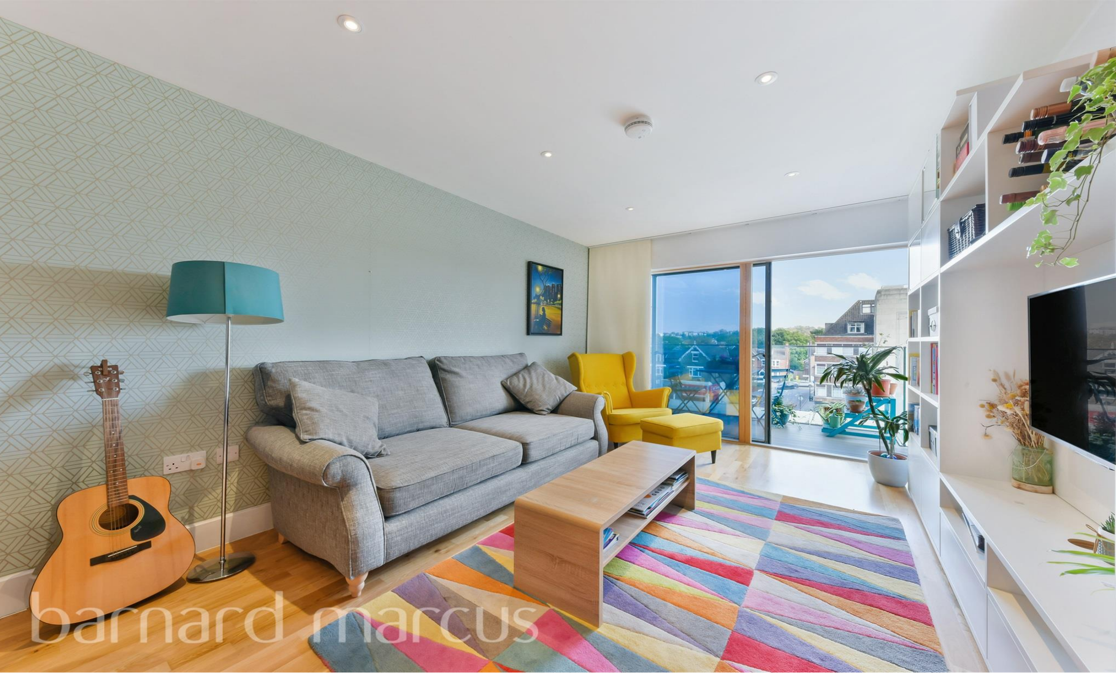
Derry Court Streatham High Road, London SW16 6AT