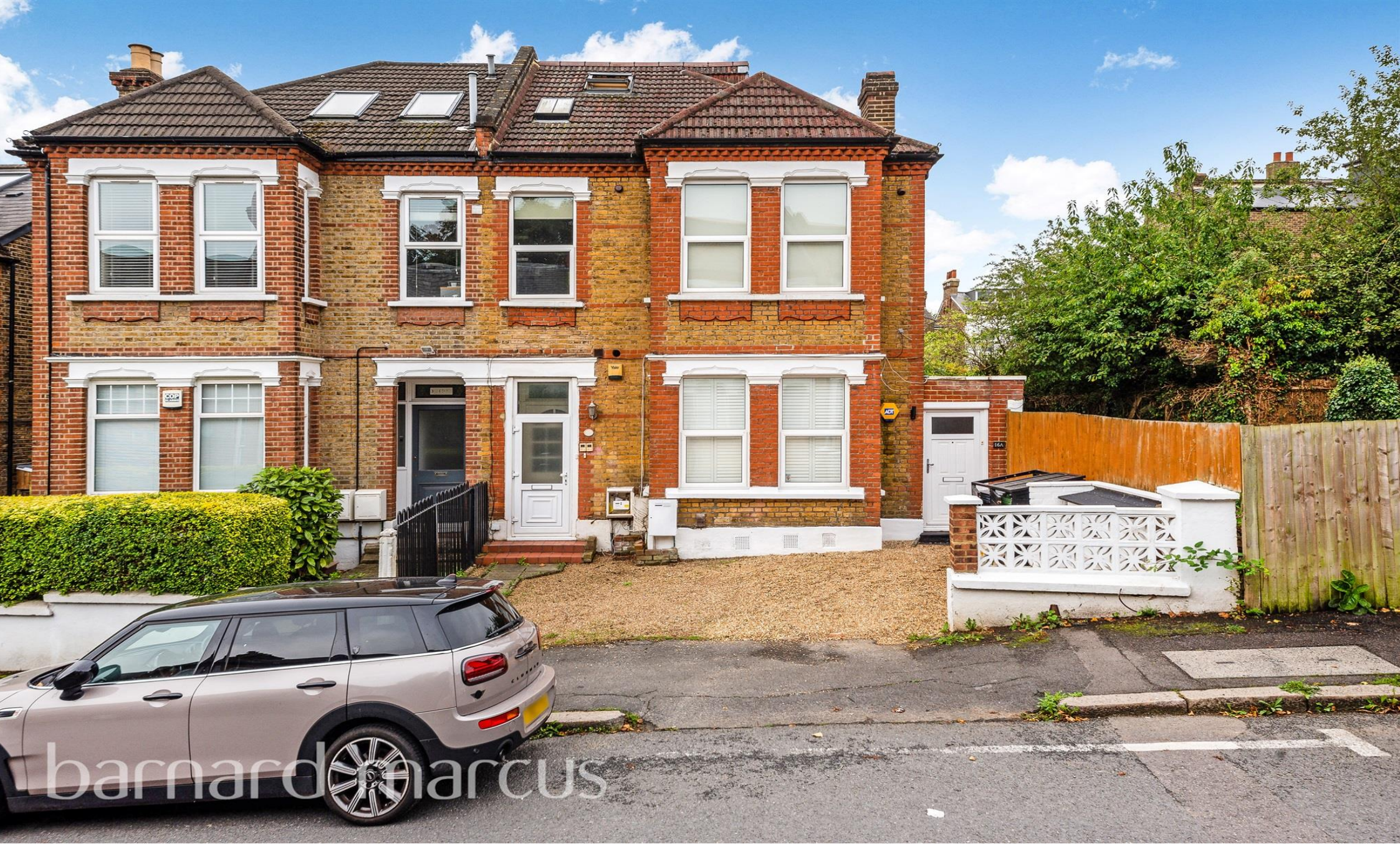
St. Julians Farm Road, London SE27 0JJ