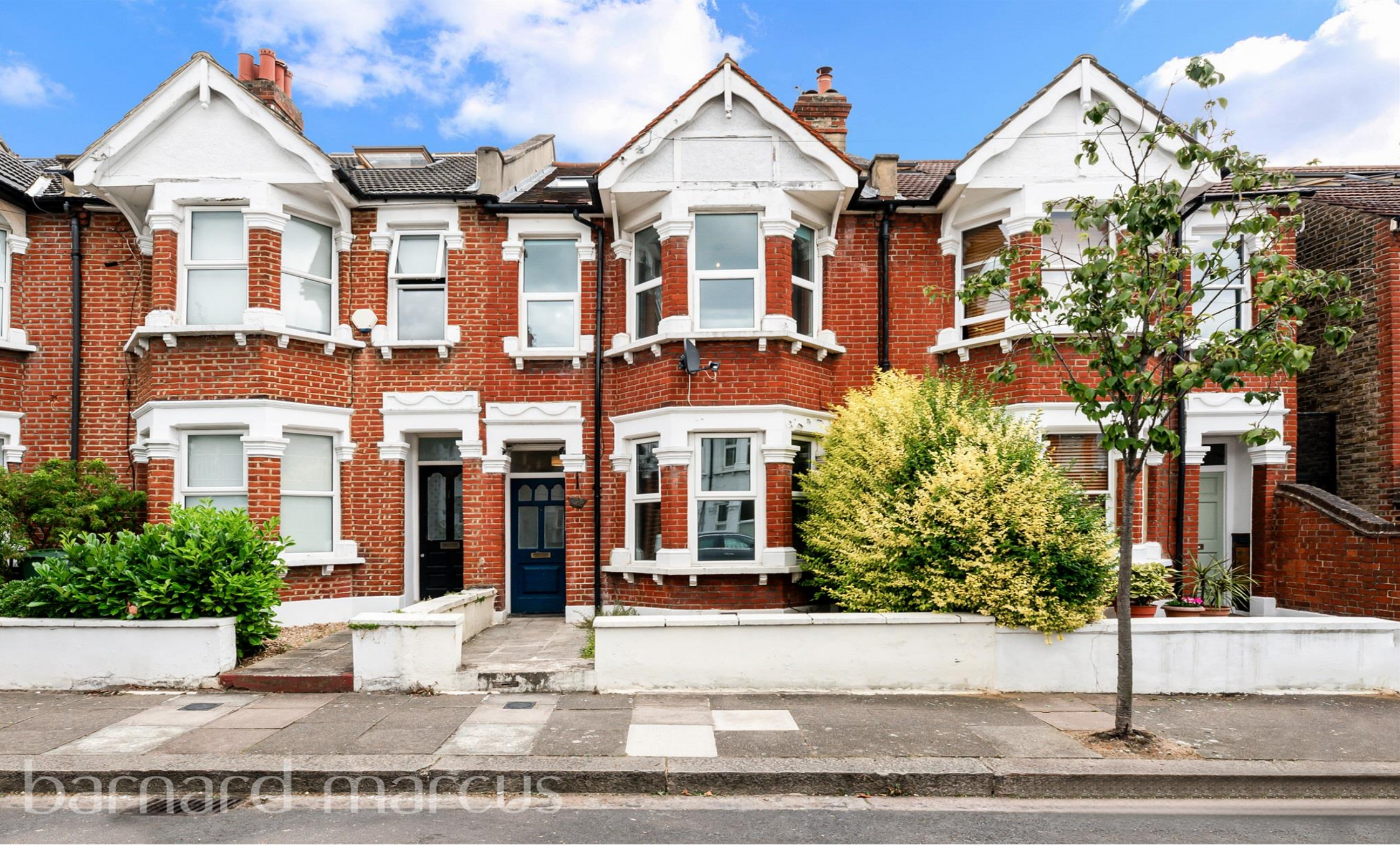
Corsehill Street, London SW16 6NE