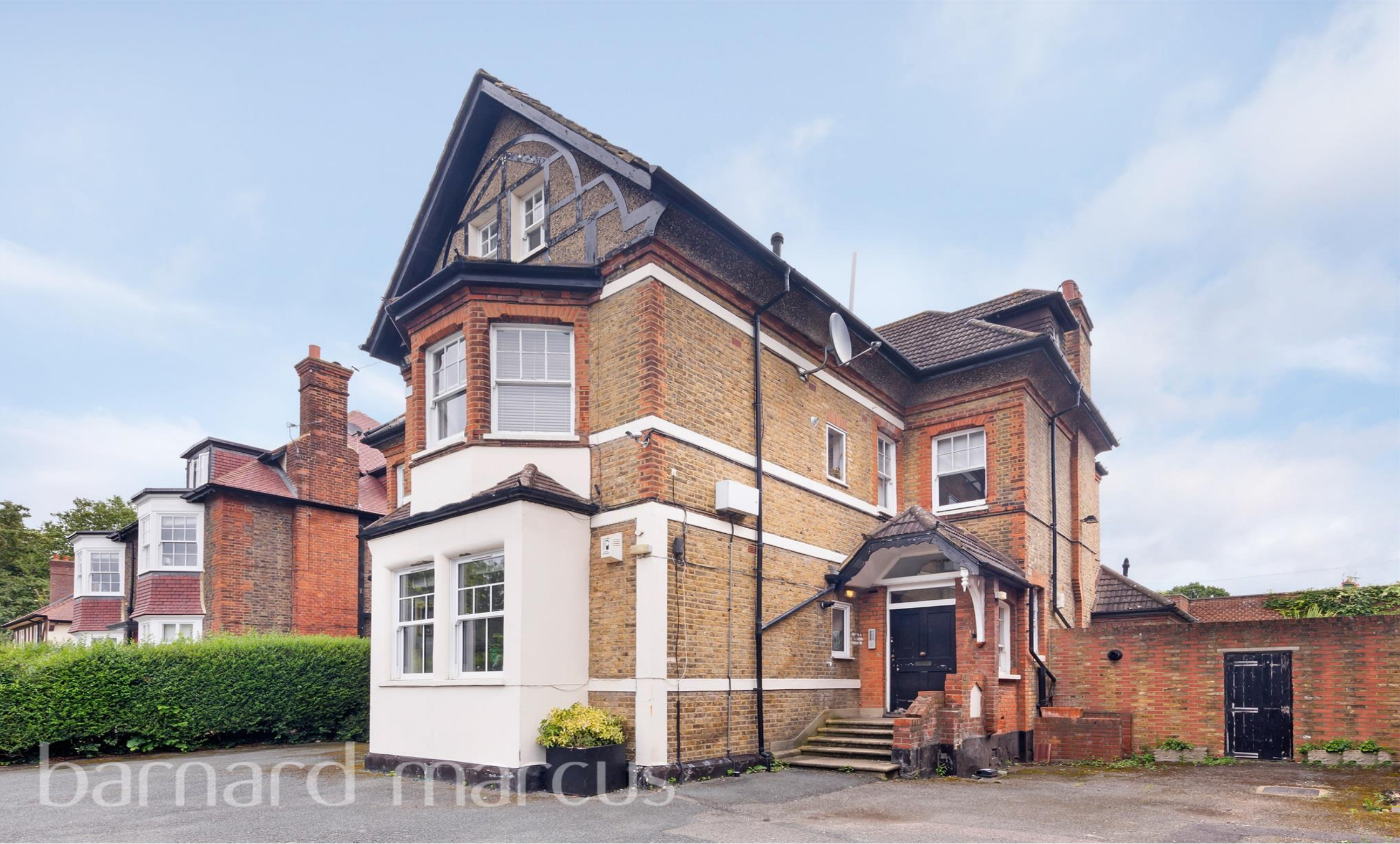
Thrle Road,London SW16 1NY