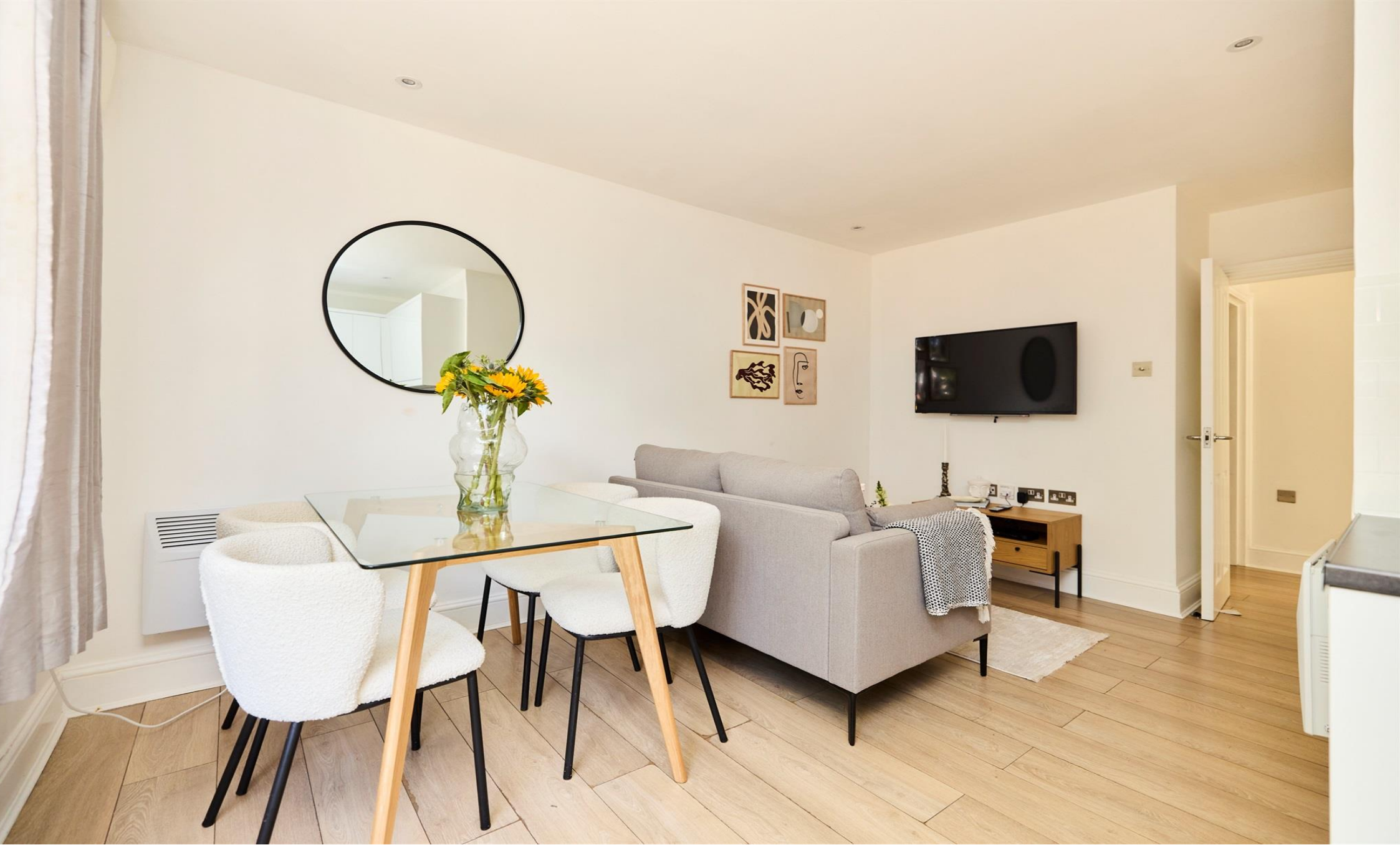
The Lodge Leigham Court Road, London SW16 2PL